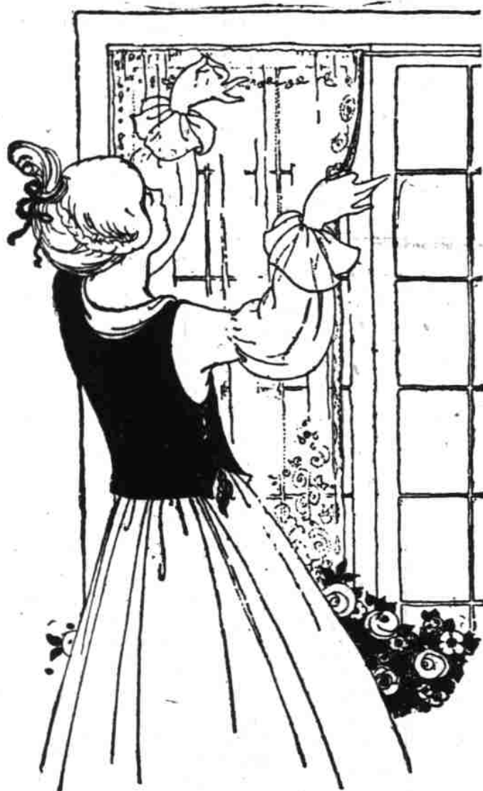
Makes lace curtains new again

You do not need to use Lux several times to learn how wonderful it is. One trial package will prove to you how lovely it leaves your things. Do not risk any more fragile silks or laces with ordinary soap, but get a package of Lux today. Use it for anything that pure water won't injure. Your grocer, druggist and department store have it. Lever Brothers Co., Cambridge, Mass.