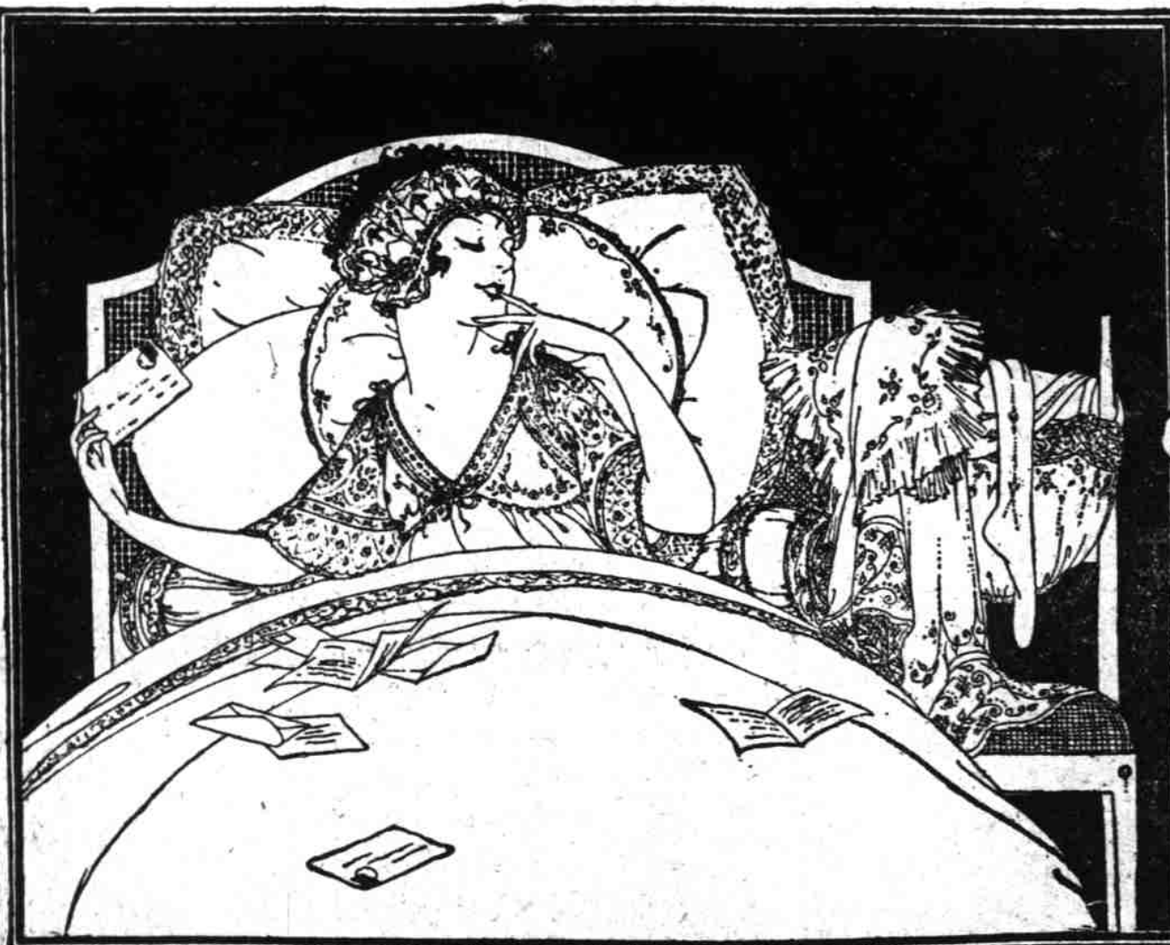
How to keep your silk underwear lovely