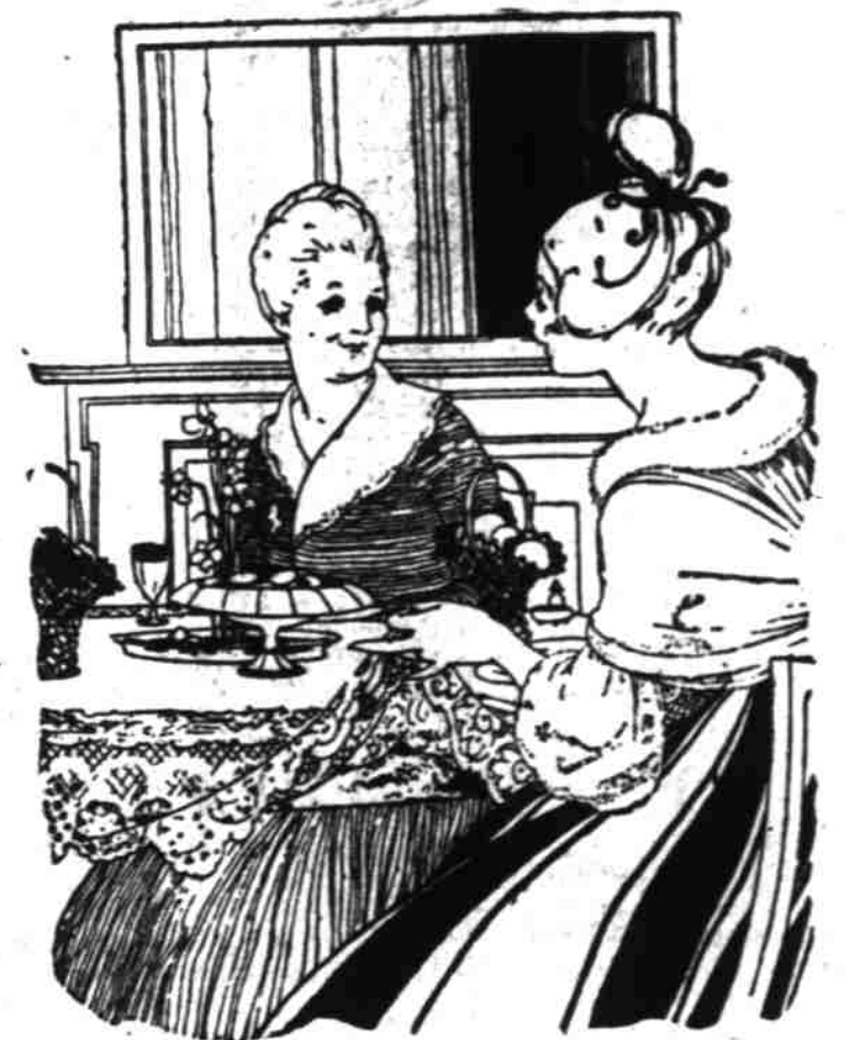
Lux makes your delicate things wear longer