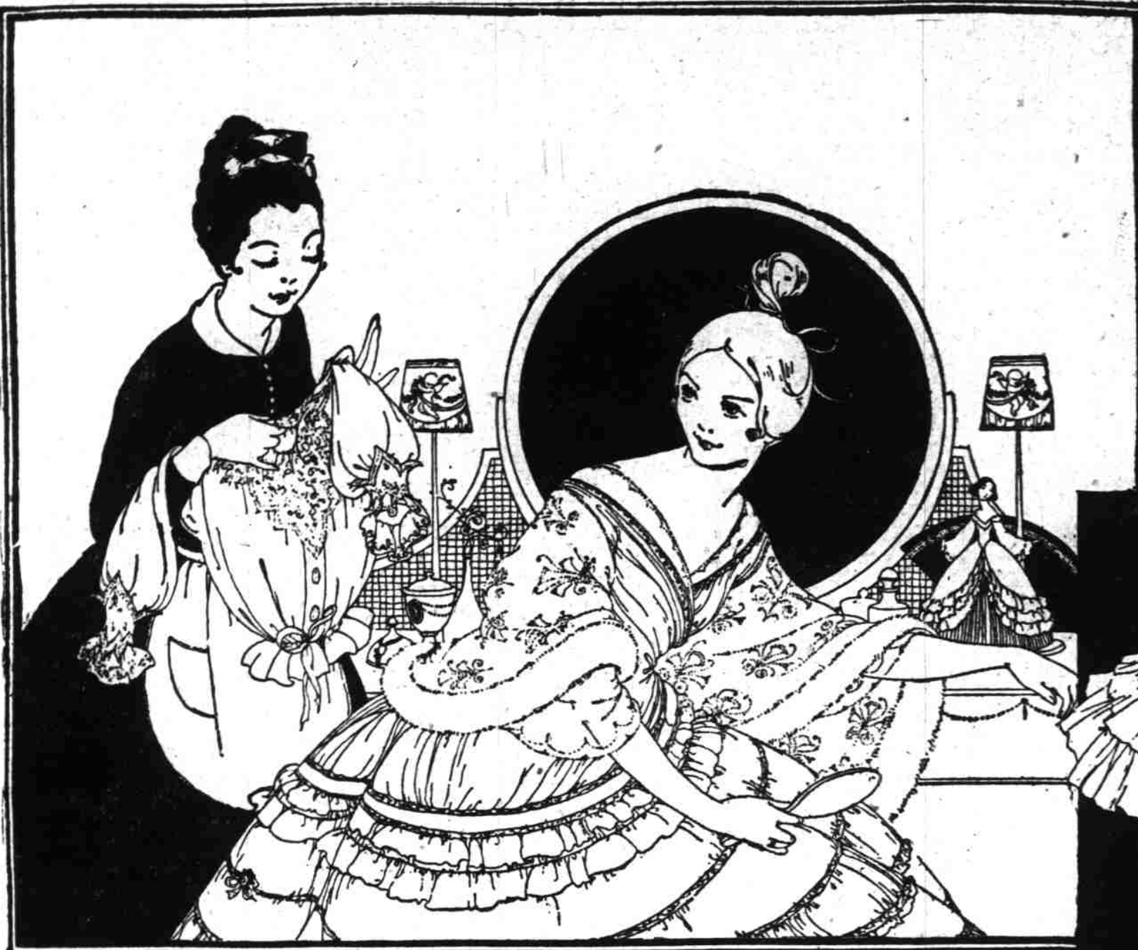
The safe way to wash silk waists