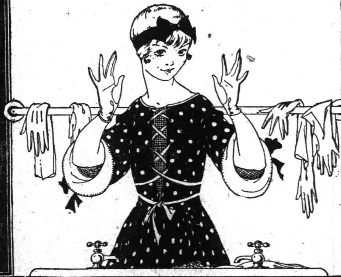
For silk and chamois gloves