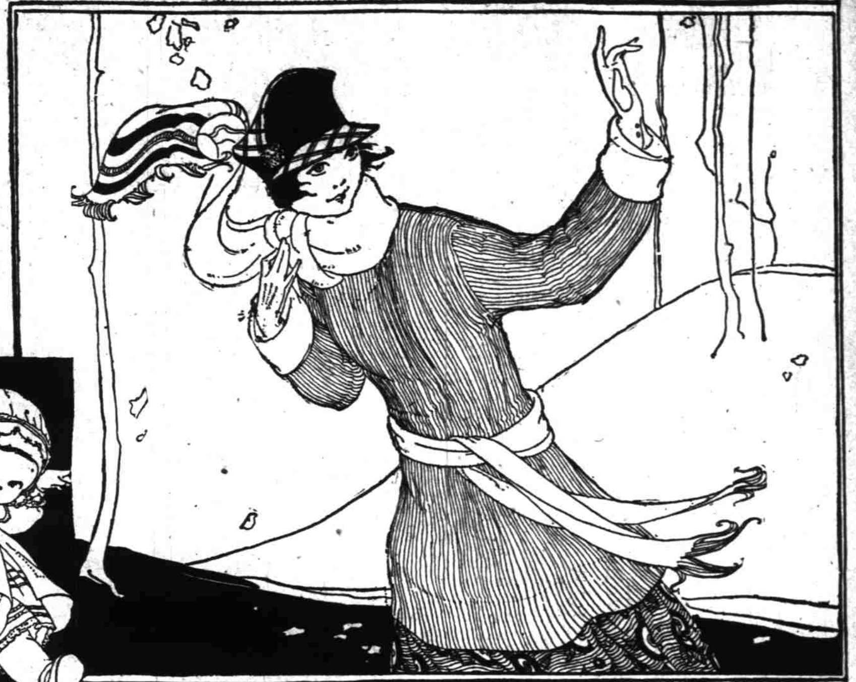
Wonderful for sweaters and sportcoats