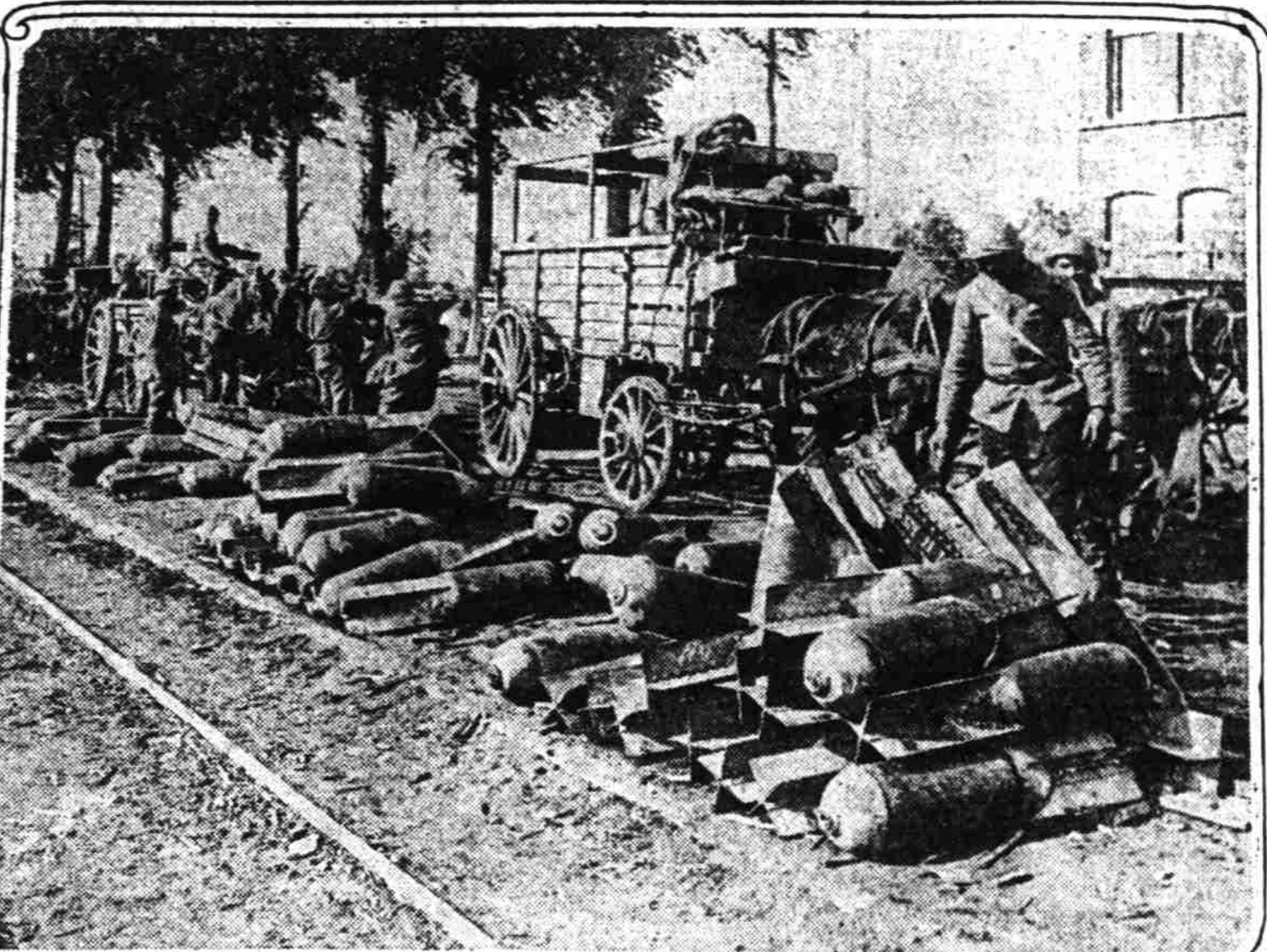
FRENCH OFFICIAL TORPEDOES