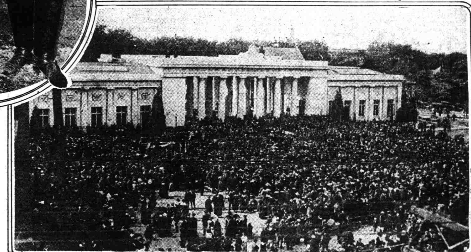
MCKINLEY MEMORIAL, NILS, O.