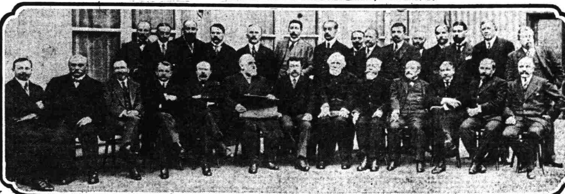
NEW FRENCH MINISTRY