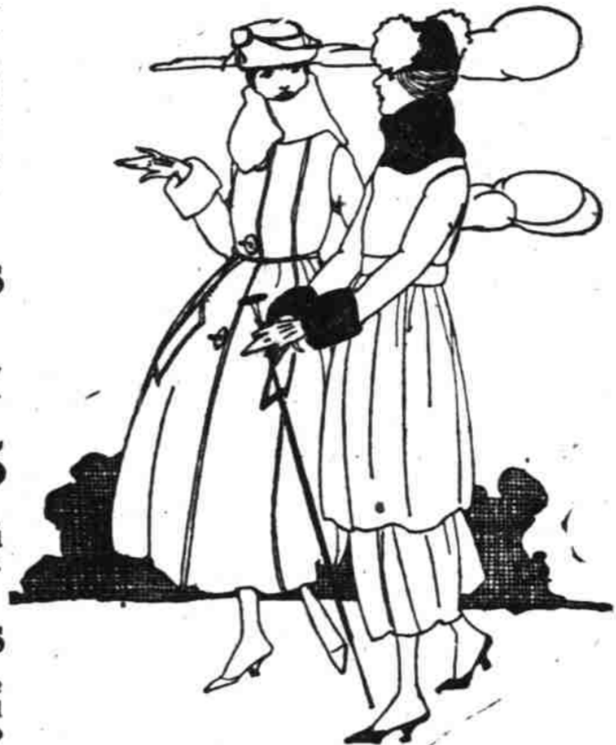
—Apparel Shop, Fourth Floor.

Side draped, pleated, surplice and braid-trimmed models—all the leading materials, styles and shades. All sizes for misses, small women and larger sizes to 44 bust.