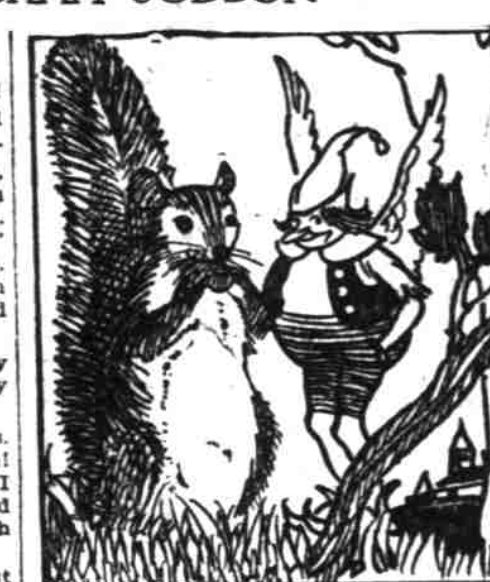
"I believe that's my mother calling me."

He met his mother. "Yes, mother," he said. "Did you call me?"