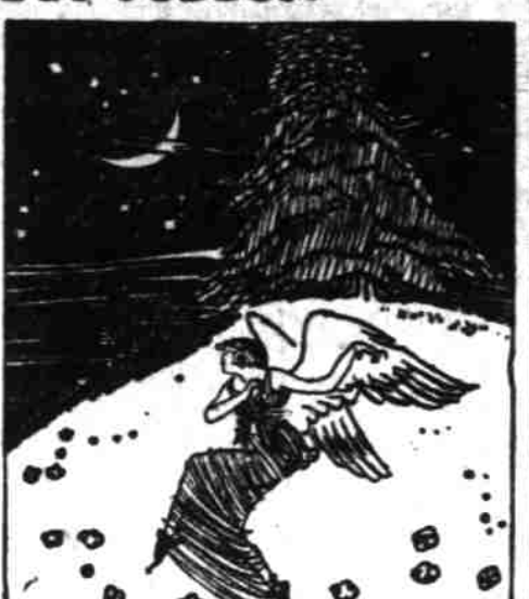
So all night long the pine leaves fretted and sighed and begged the wind to take them a sail.

"Pooh!" interrupted the maple, "any- tree and gave us such a sail! one can see I am the handsomest; none