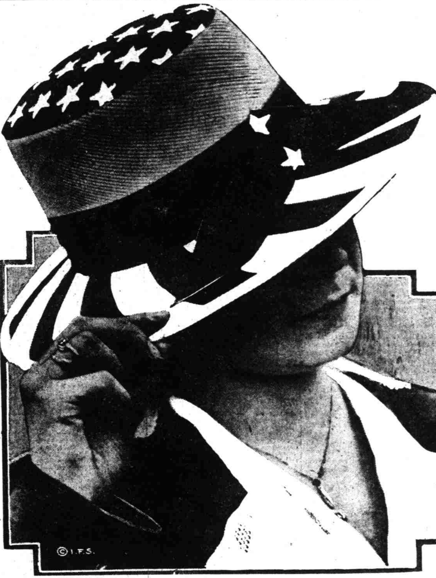
One of the newest of the season's patriotic hat offerings, some less elaborate samples of which are being displayed to Portland shoppers.