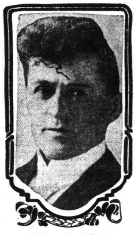
William S. Gilbert.

Exercises Will Be Conducted at the Mt. Tabor Presbyterian Church in Forenoon