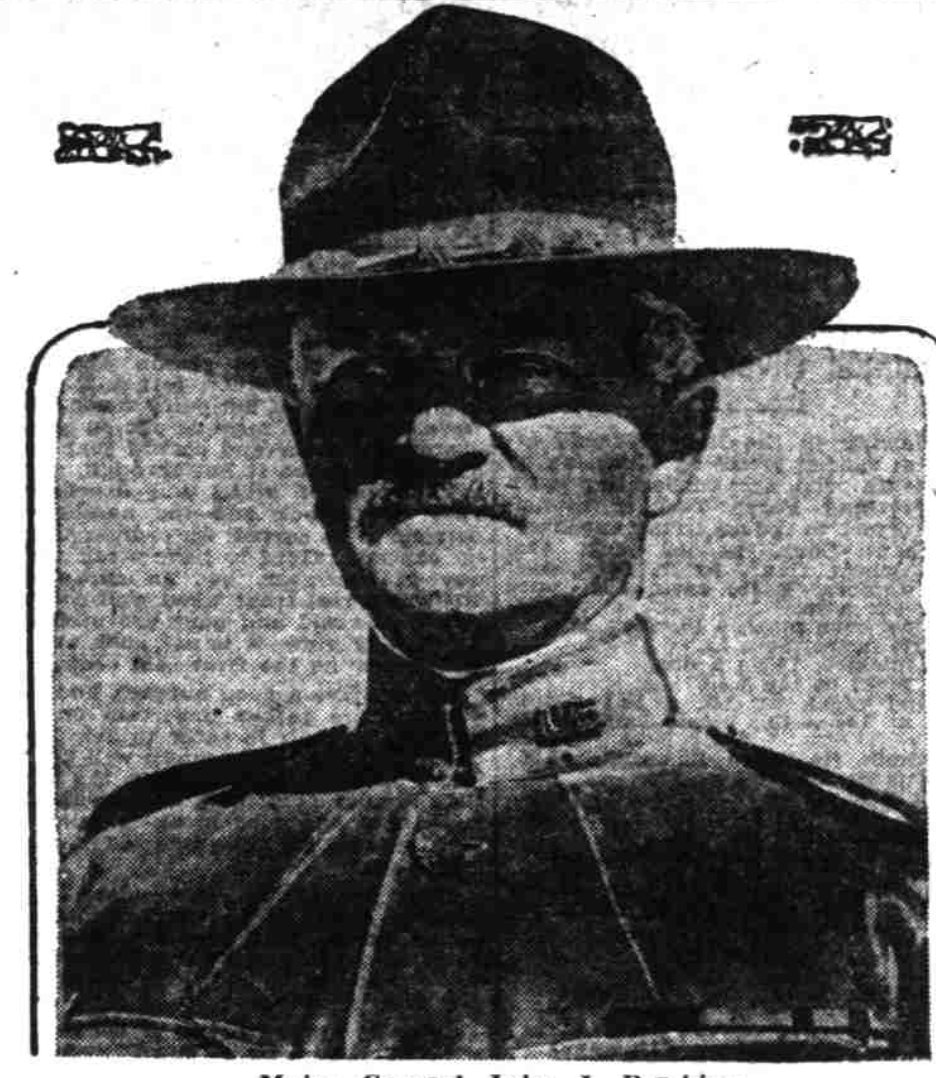
Major General John J. Pershing.

El Paso, Texas, Feb. 21.—(U. P.)—Major General Pershing was notified today by Secretary of War Baker of his appointment as commander of the southern department, succeeding General Funston. He will leave for headquarters at San Antonio sometime this week.