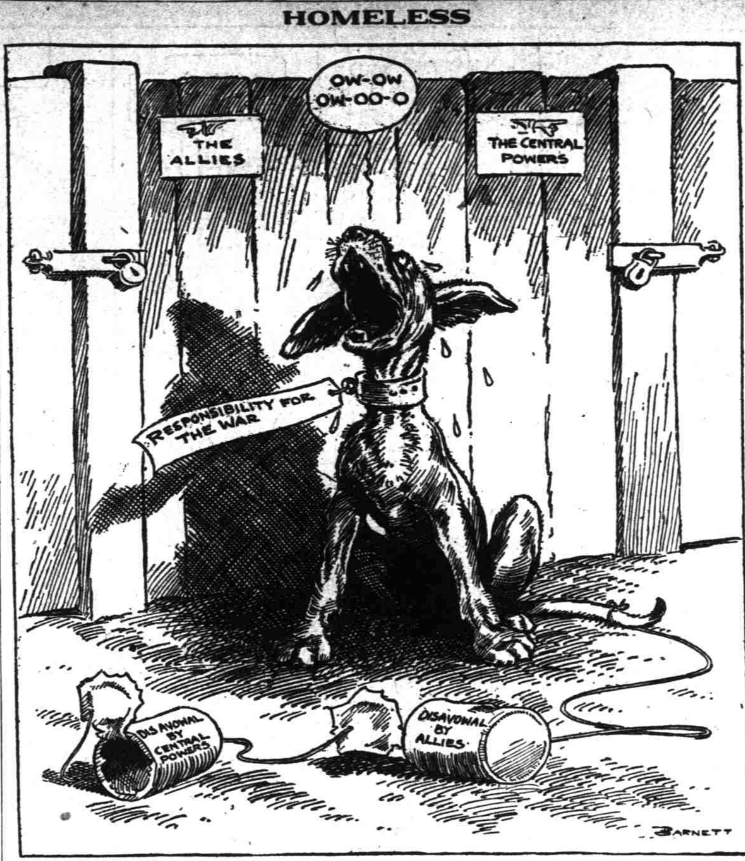
—From the Los Angeles Express.