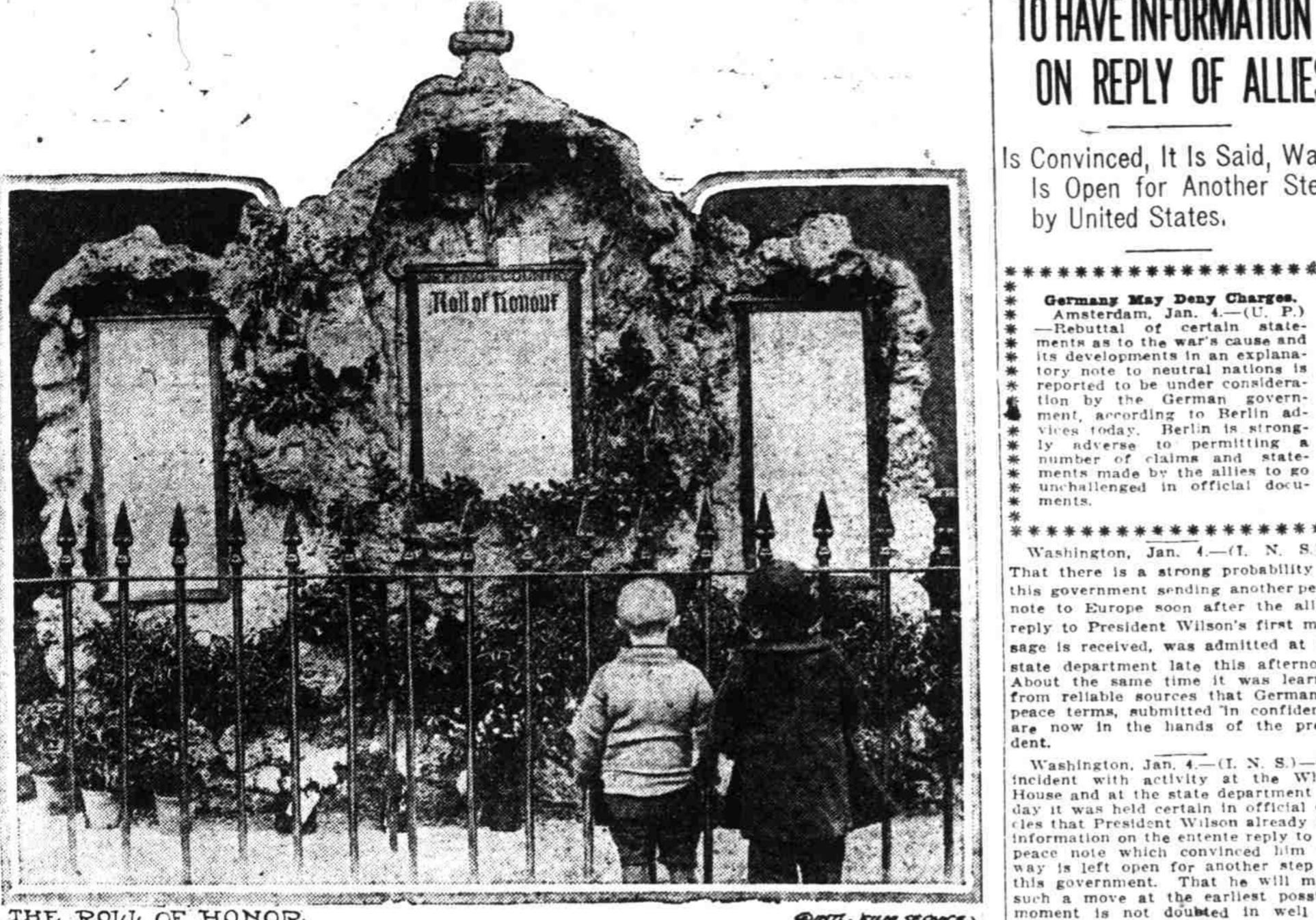
THE ROLL OF HONOR. This is the first permanent war shrine erected in England as a result of the big European conflict. It is in Gloucester street, London W., and bears the name of 750 men who joined from that section of London and who were killed at the front.