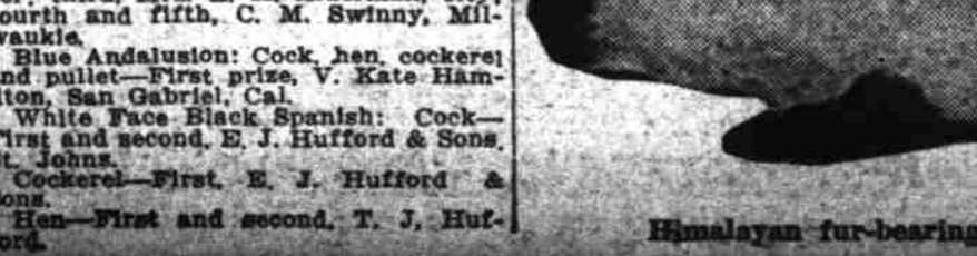
Himalayan fur-bearing rabbit, owned by Edgar Kline.