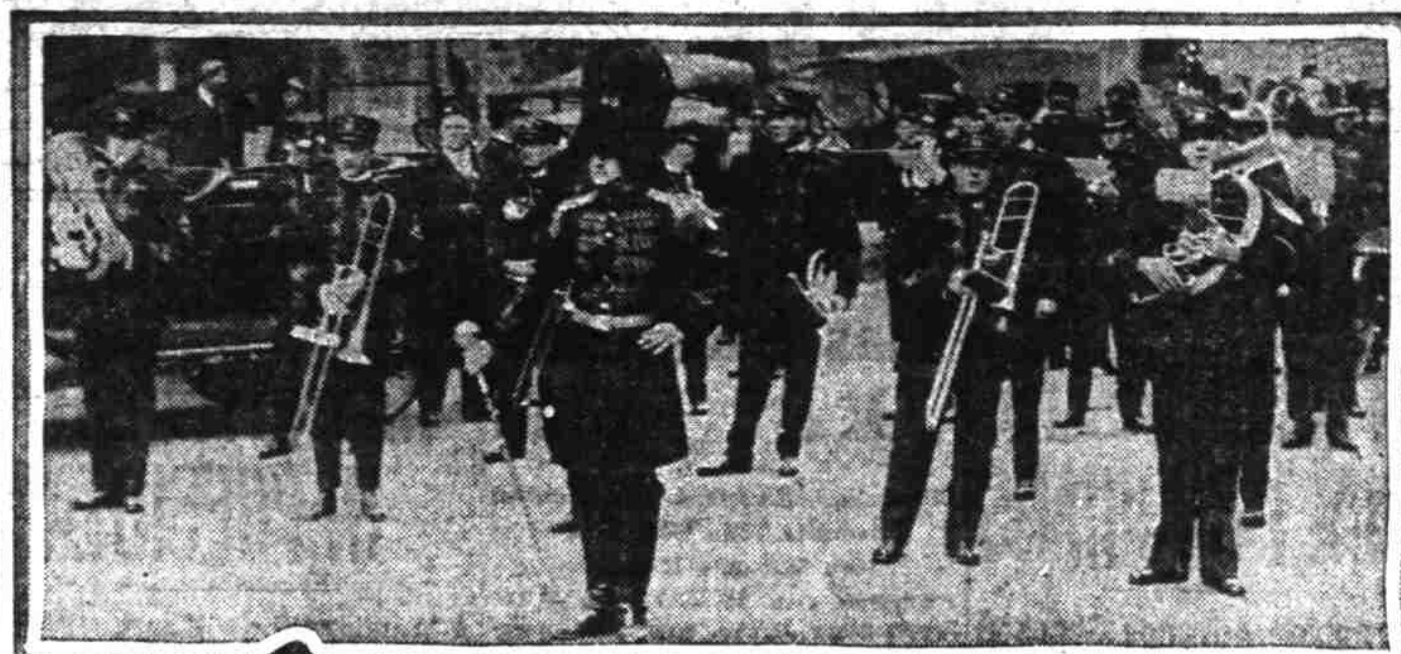
Above—Gul Reazee band. Below—Members as seen on march.

Gul Reazee Grotto, Velled Prophets, left this morning for Seattle over 100 strong, with the Grotto band and the uniformed drill guard. They will be