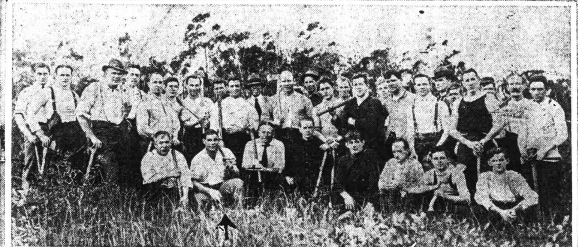
AUSTRALIAN BOXERS AS HOME BUILDERS

Boxers ready to clear away brush to build homes for wounded Australian soldiers. Les Darcy, the Australian middle weight champion, is indicated by an arrow. At his left is Snowy Baker, the Australian promoter. Darcy is too young to enlist and his aged mother, of whom he is the sole support, has denied her permission for his enlistment in the over-seas forces.