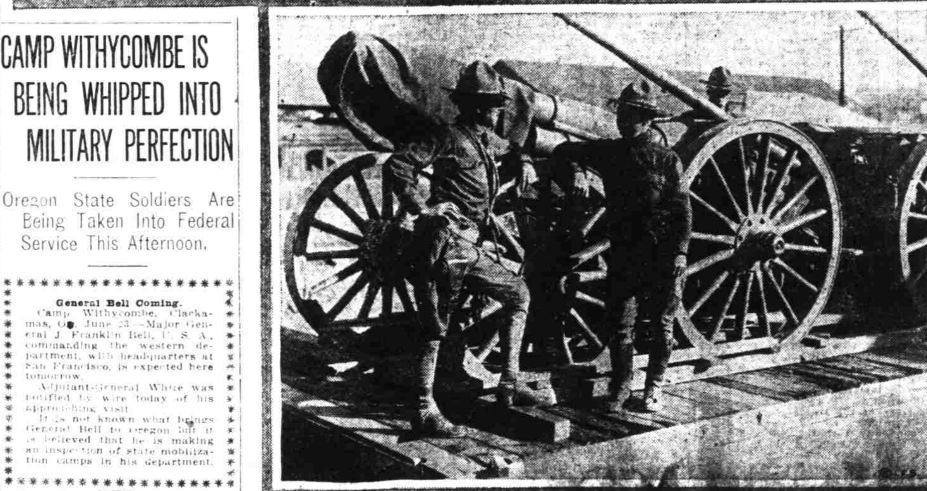
Below—Battery A of the Fifth United States artillery, en route for El Paso. A number of 4.7 inch guns, part of the equipment of this battery. Below—A couple of "Long Toms," as the American 4.7 inch field piece is called, being moved on a flat car to El Paso. These guns are deemed by experts the most deadly of all field pieces next to the famous French "75's."