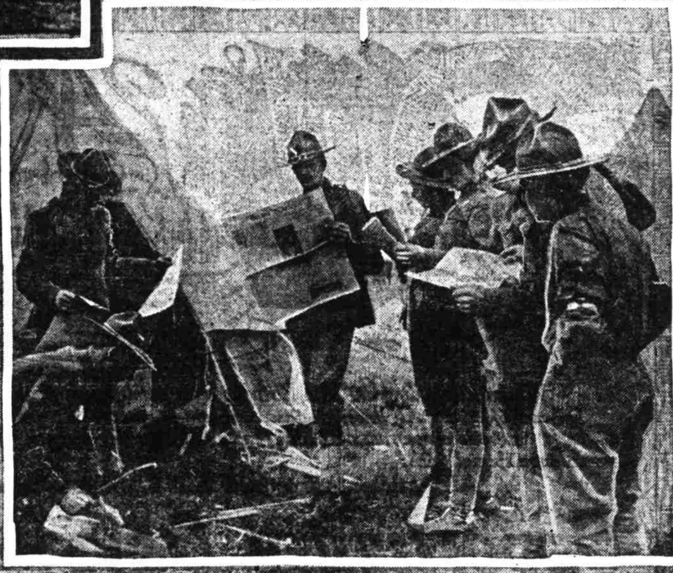
The mobilization camp of the Oregon National Guard sprang into being at Clackamas yesterday with the arrival on the field of Company M from Salem, and Companies B and F from Portland. Above, left, are shown guardsmen among the first arrivals, unloading tents, boxes and supplies. On the right is shown the Salem boys in camp. Below, left—Men of Company F clearing ground for the company mess tent. Right—A camp scene in Company M row; chopping kindling and reading The Journal, copies of which arrived at Clackamas with the Portland troops.