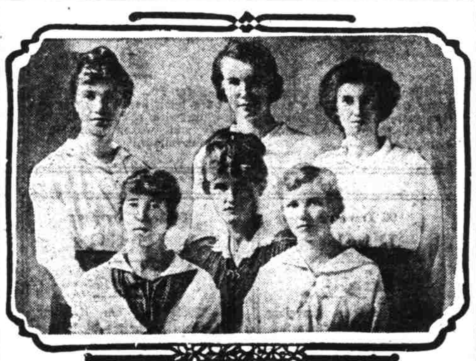
Albany college delegates to the Y. W. C. A. summer conference at Seabeck, Wash.