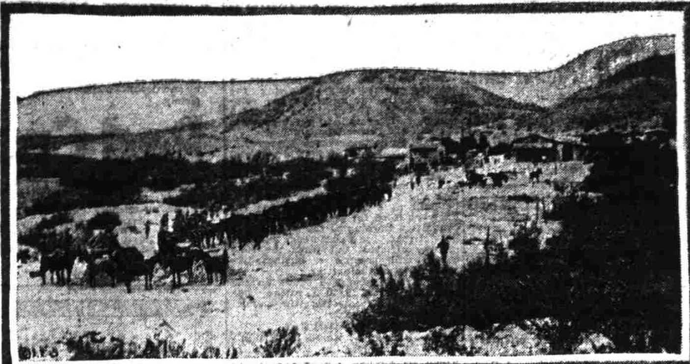
The scene of the raid on Deamer's store at Boquilla, Texas, where the Mexicans looted the general store at right in background of the picture. The photo shows the camp of the Eighth United States Cavalry soon after the arrival of the outfit on the scene of the raid.