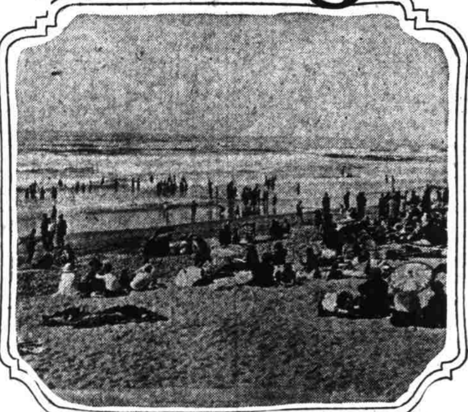
Above—Hotel Moore, Seaside, Or. Below—Surf bathing scene at Seaside.

soulful gaze, saw in her a kindred spirit and said: "What do the breakers look like to you, and what message do the waves bring you?"