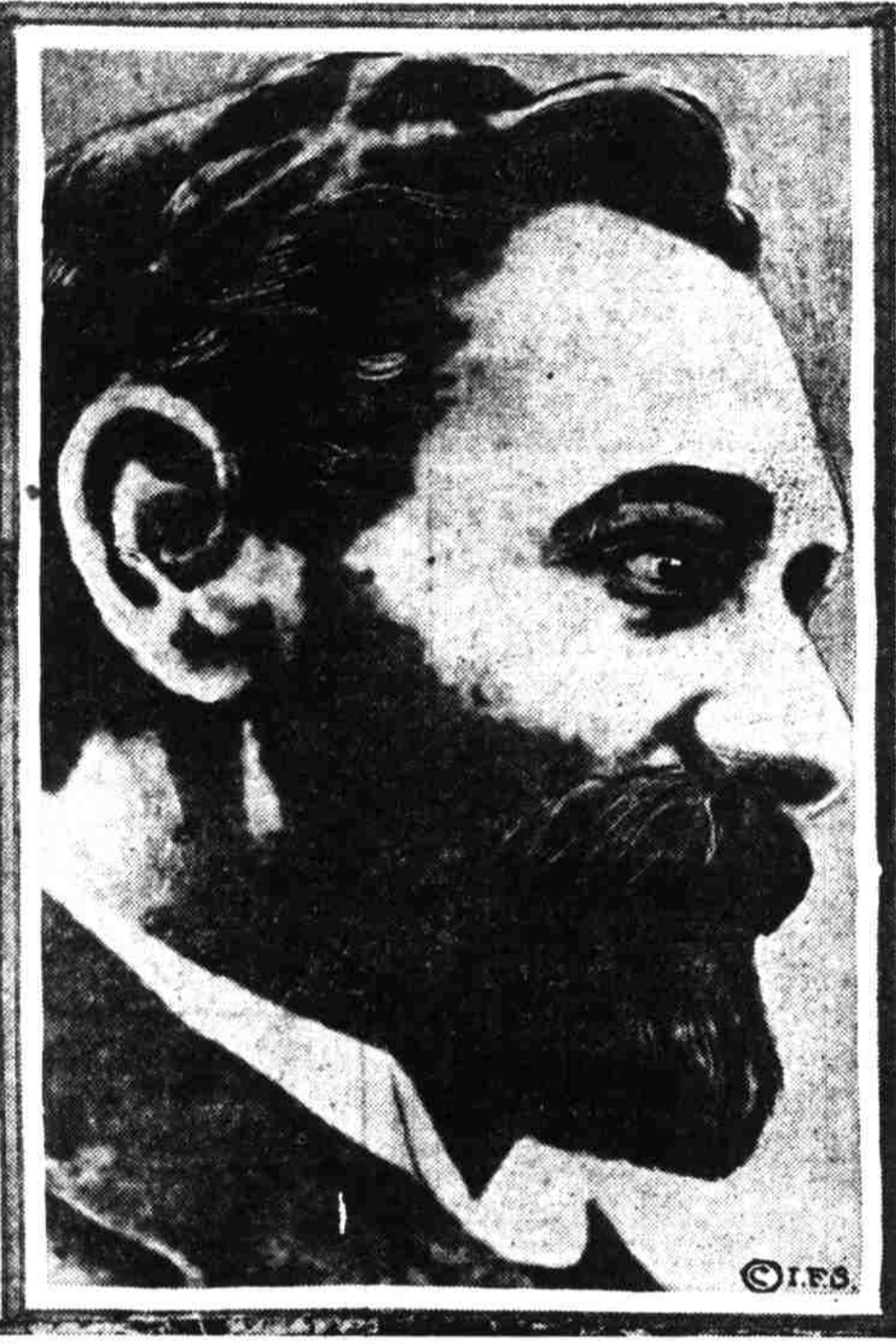
SIR ROGER CASEMENT