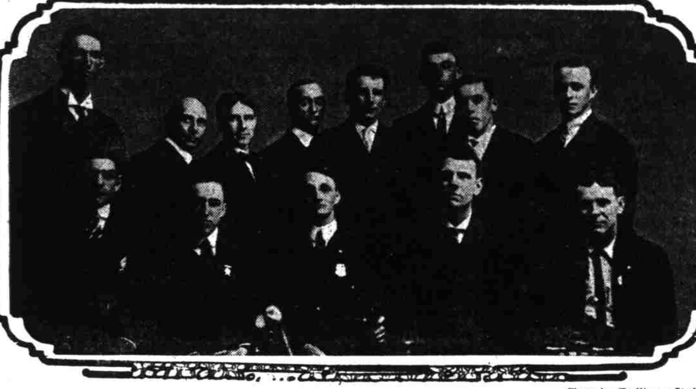
Officers of the McMinville Fire Department, McMinville, Oregon.

McMinville, Or., May 13.—McMinville is mighty proud of its fire department. Officers of the organization as shown in the photograph are: Reading from left to right, bottom