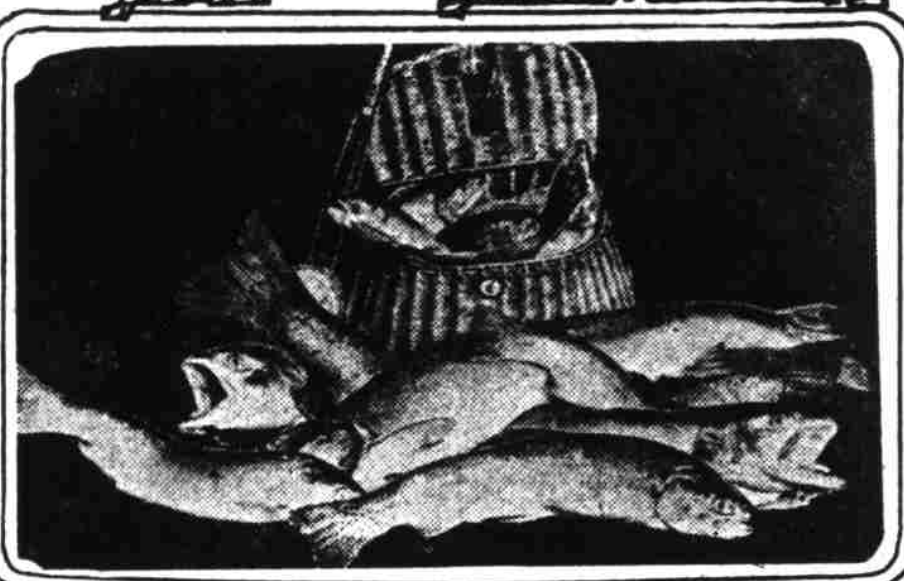
Above—Wasco county courthouse. Below—Trout caught in vicinity of The Dalles.