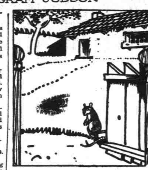
Mrs. Tommy followed close at his heels.

The Joke Is on Tommy Tittle-Mouse. THE day after Tommy Tittle-mouse had so carefully hidden a good many grains of corn under the big boards of the lily bed, he wakened with a pleasant feeling that he was going to have a very good day.