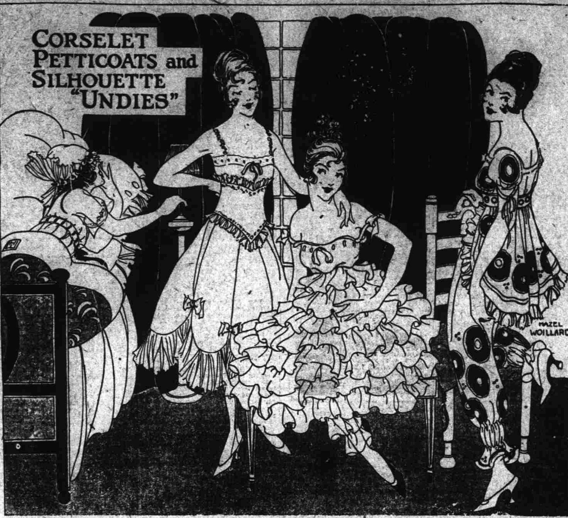
Left to right—Nightgown of pale pink nylon, with bodice cap of the same material trimmed with silver tissue roses and black velvet ribbon; corselet petticoat, with fitted girdle, so designed as to diminish the waist measurement and to keep the lingerie snugly arranged; not content with ruffles on the outside, a lady has them underneath. The ruffled petticoat gives bouffancy to frocks of light fabric; very much like a Baskin siren is the pajama person clad in the new novelty garment that is nighty, negligee and pasties.

How to Transfer Design. If very sheer material is used it may be laid over the pattern and the design traced through the celluloid. Or the design may be easily transferred by placing a piece of carbon paper on the material, shiny side down, and the design on top of the carbon. In tracing the pattern with the use of carbon paper use a very sharp pencil or a new orange wood stick.