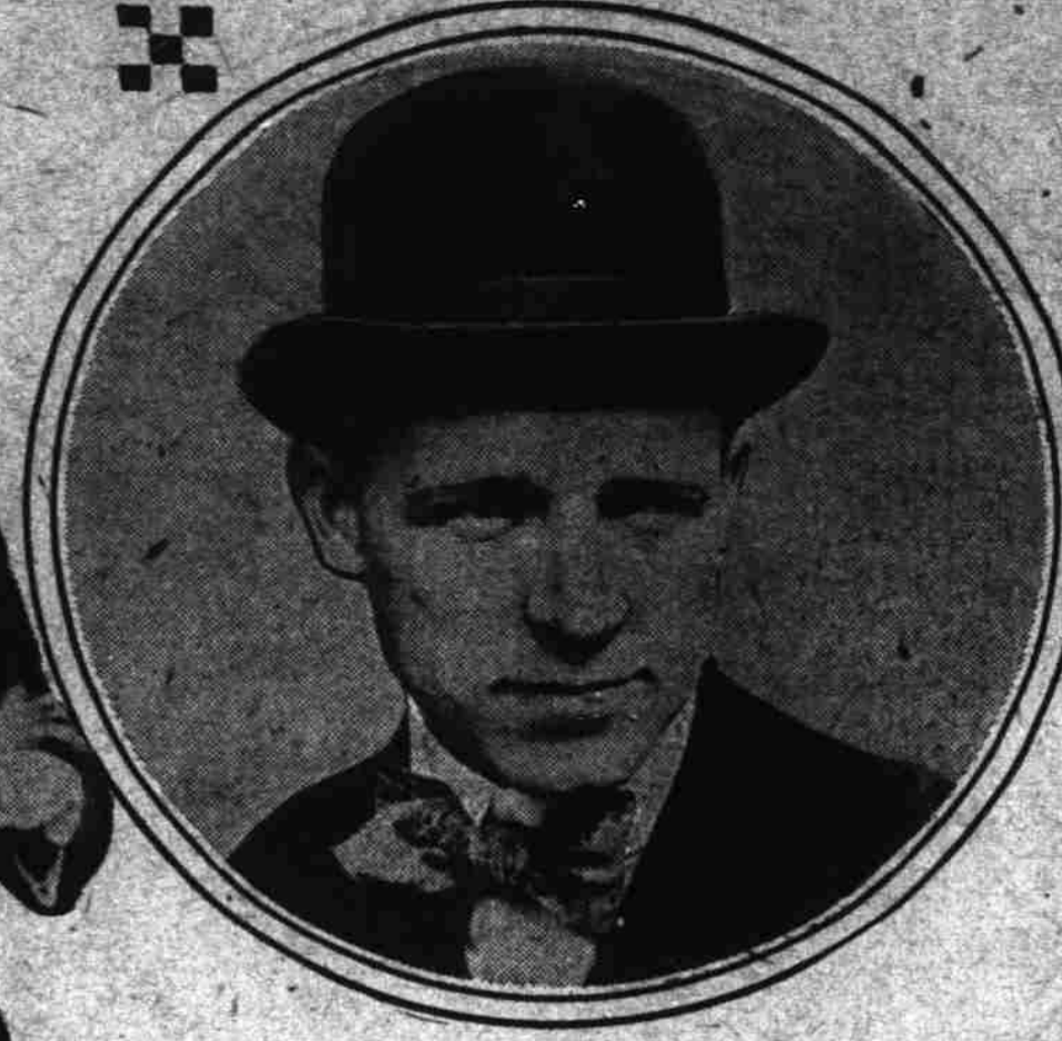
Fifth Avenue Derby.—Buffum & Pendleton.