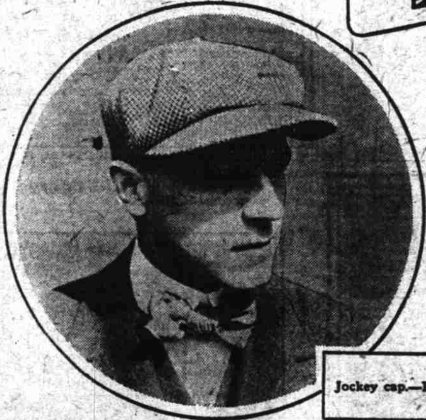
Jockey cap.—Buffum & Pendleton.