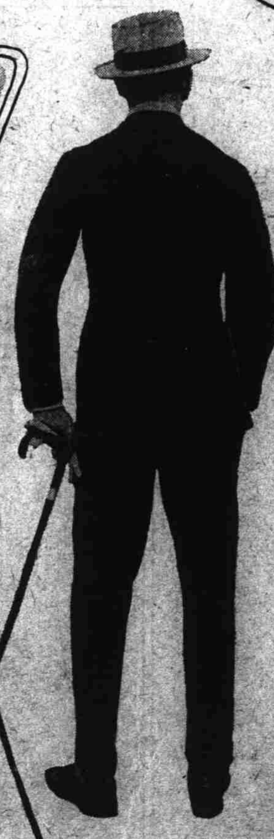
Pinch-back suit.—Politz Clothes Shop.