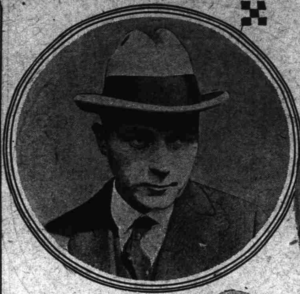
Fifth Avenue Fedora.—Buffum & Pendleton.