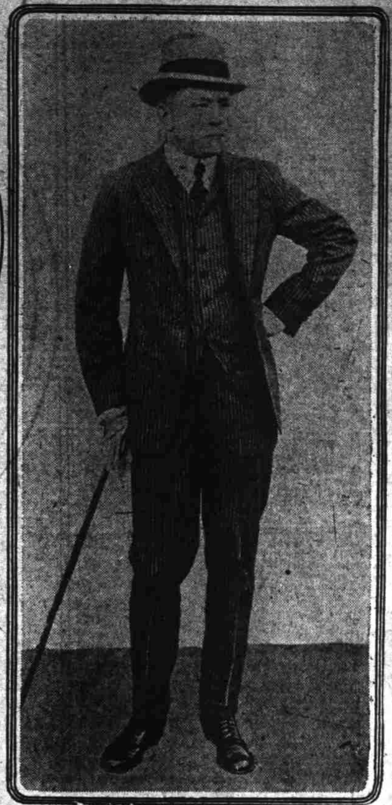
Two-piece outing suit.—Samuel Rosenblatt & Co.