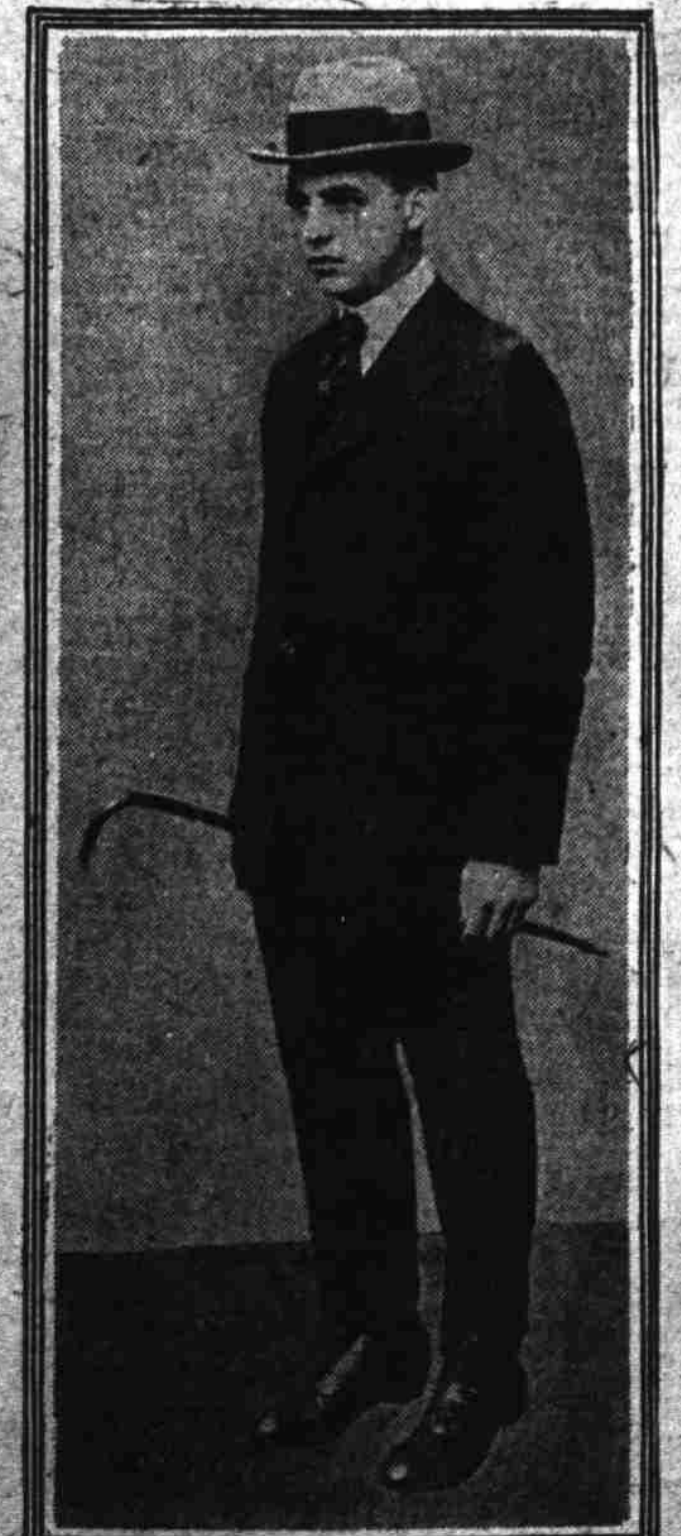
The Regent, sack suit on English lines, flat top Fedora.—Phegley & Cavender.