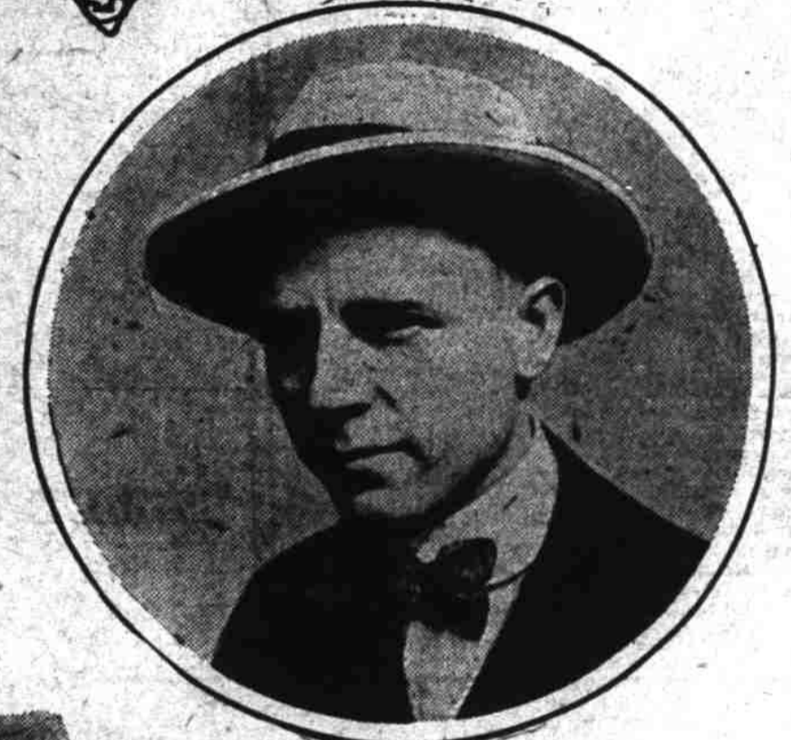
Trooper shape lightweight hat.—Buffum & Pendleton.