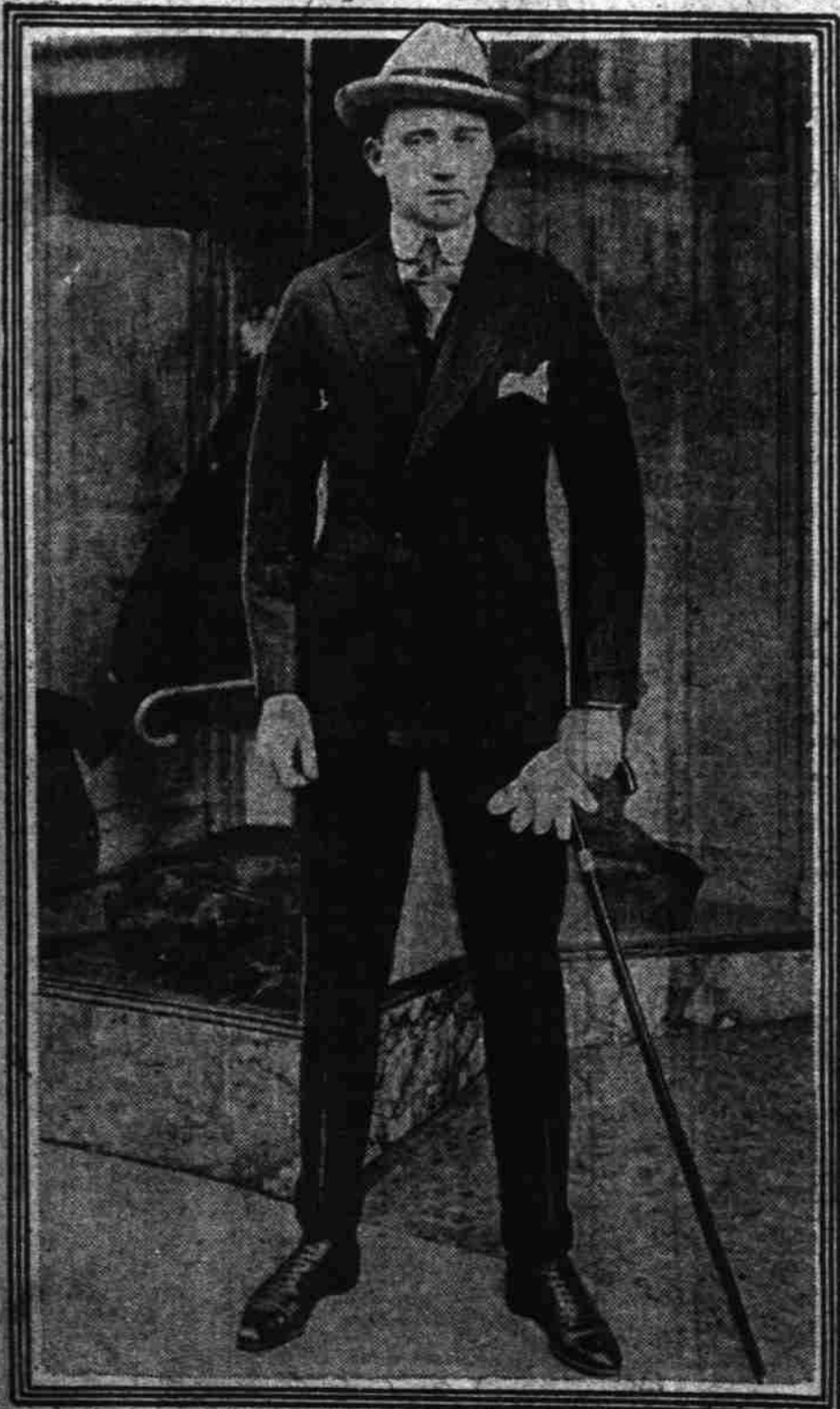
One-button, double-breasted suit.—Politz Clothes Shop.