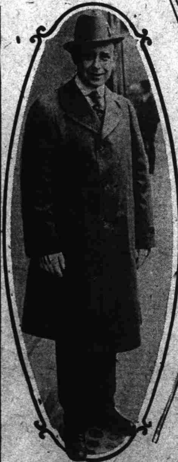
Iridescent raincoat, light weight, rain proofed.—Lion Clothing Company.