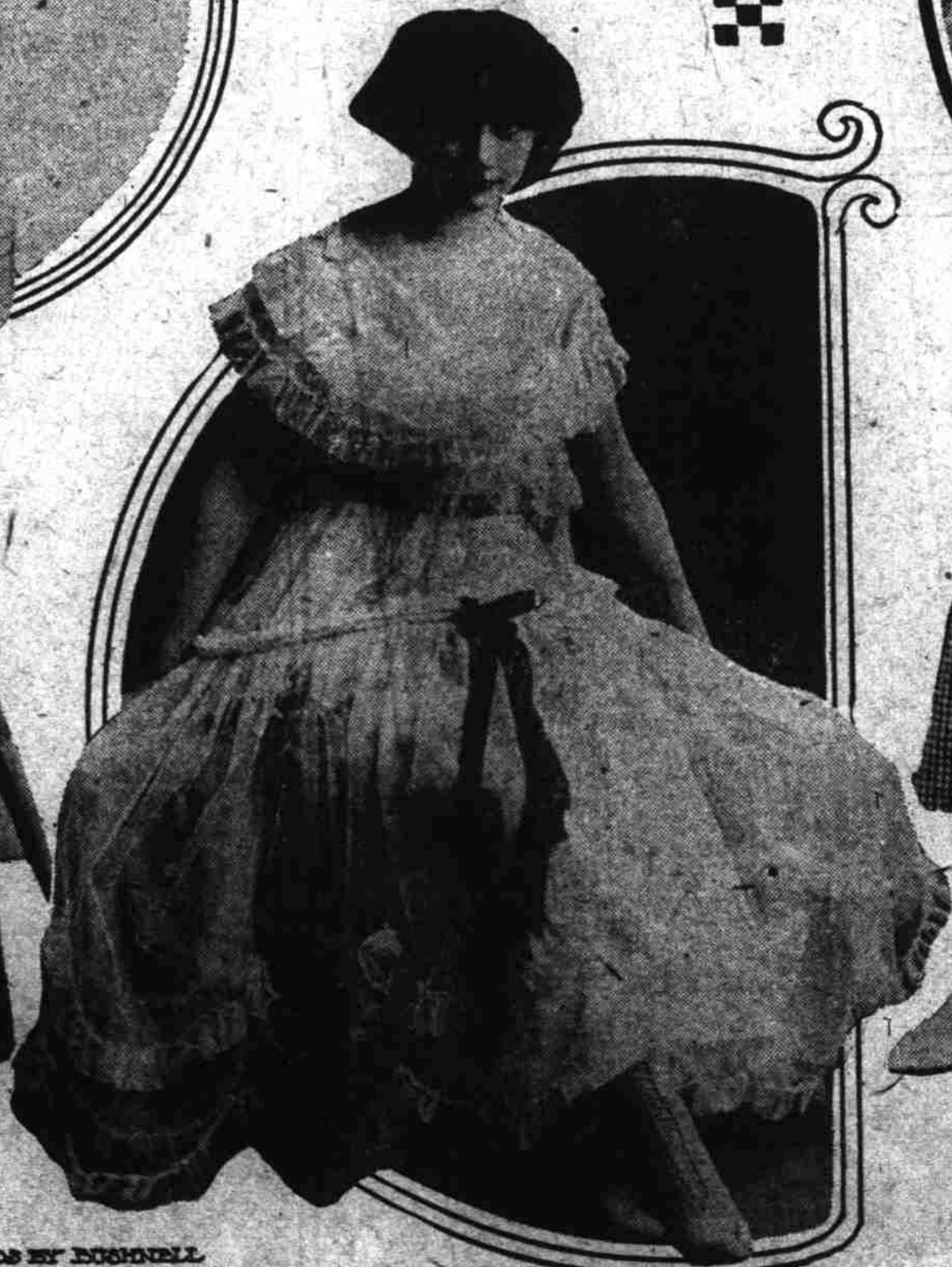
White net evening gown over silver cloth with touches of black velvet.—The W. S. Settle Shop.