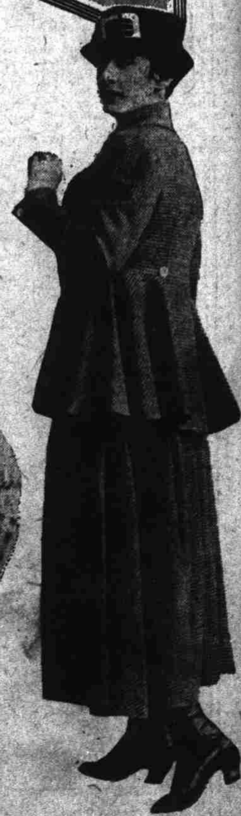
Pastel blue and orange check suit. C. E. Holiday Co.