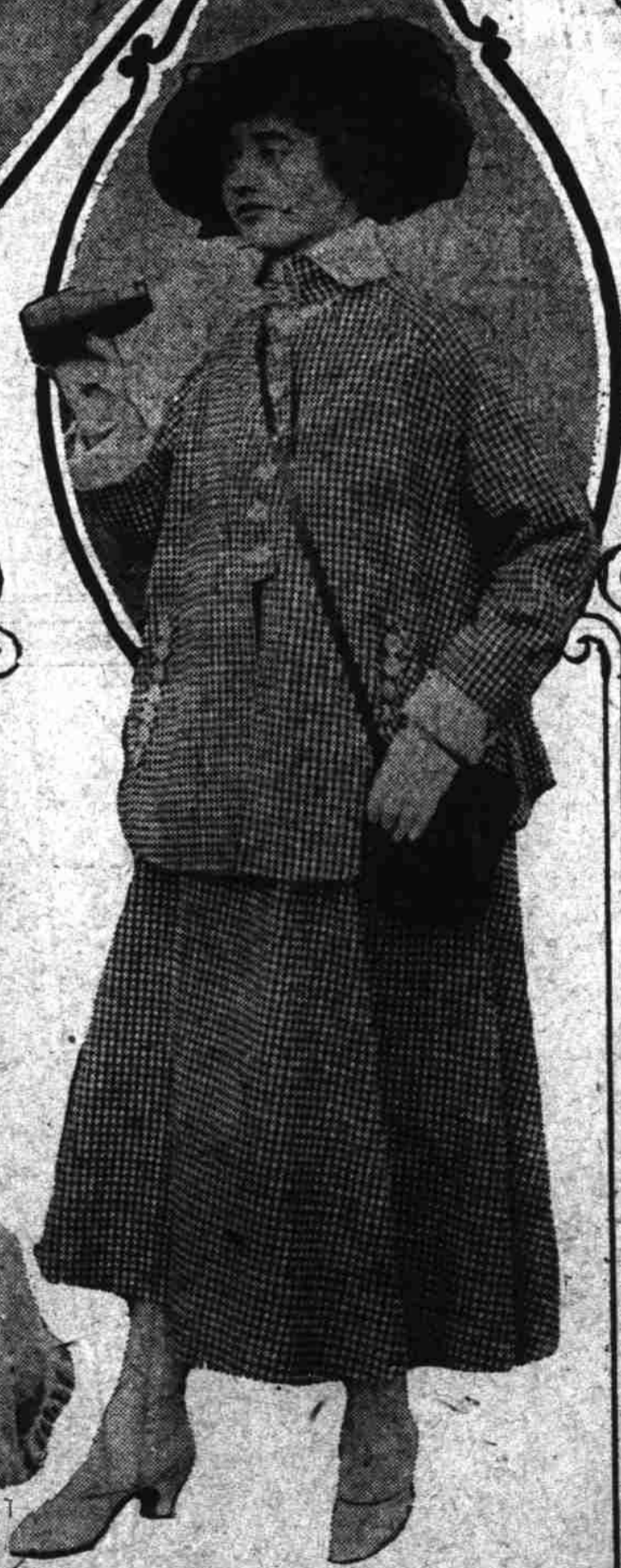
Brown check suit with collar and cuffs of white broadcloth.—Eastern Outfitting Company.