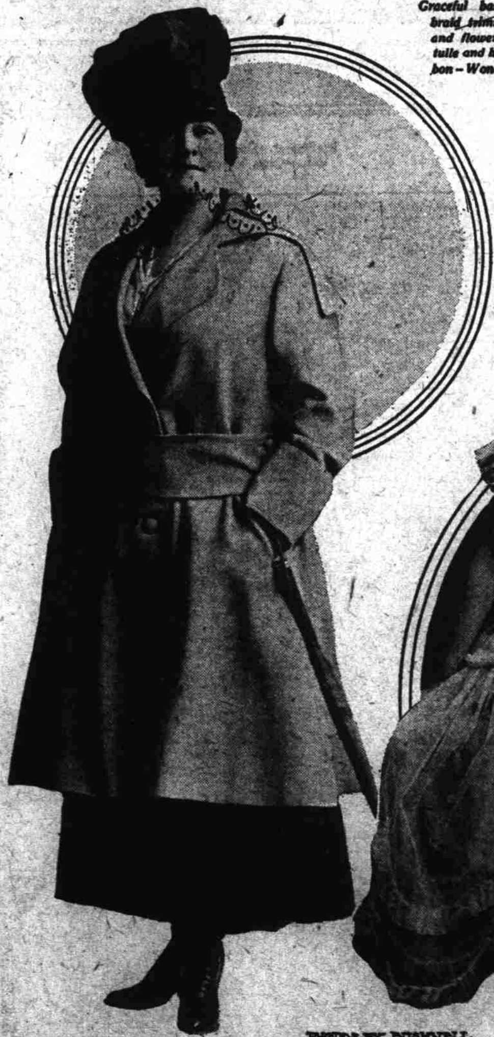
Tan gabardine three-quarter length coat with flaring cape collar. Pattern hat trimmed with bows of black satin, new pointed veil. Emporium.