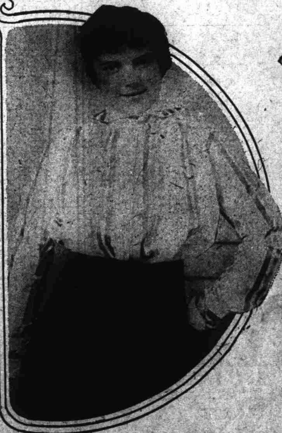
Tailored waist of white tulle with shaded blue stripes.—Lipman, Wolfe & Co.