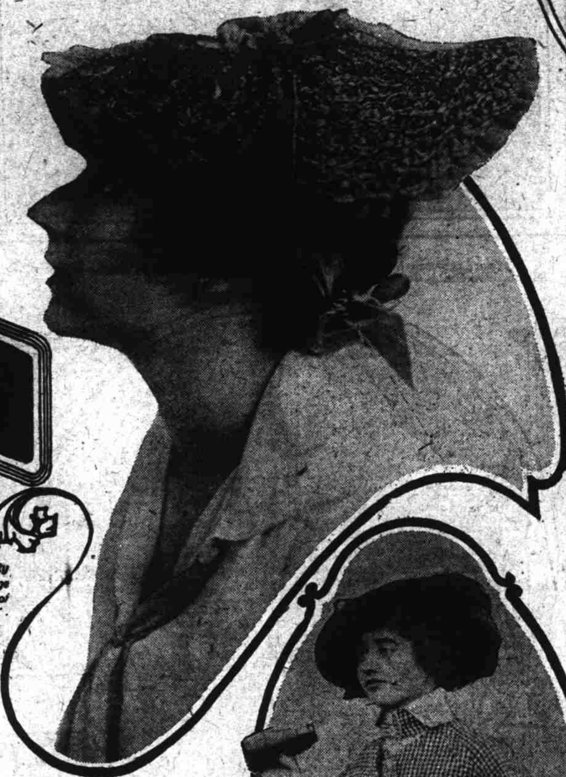
Graceful basket-shape in black novelty braid, trimmed with delicate foliage and flowers, edged with soft frill of tulle and held in place with opalescent ribbon.—Wonder millinery.