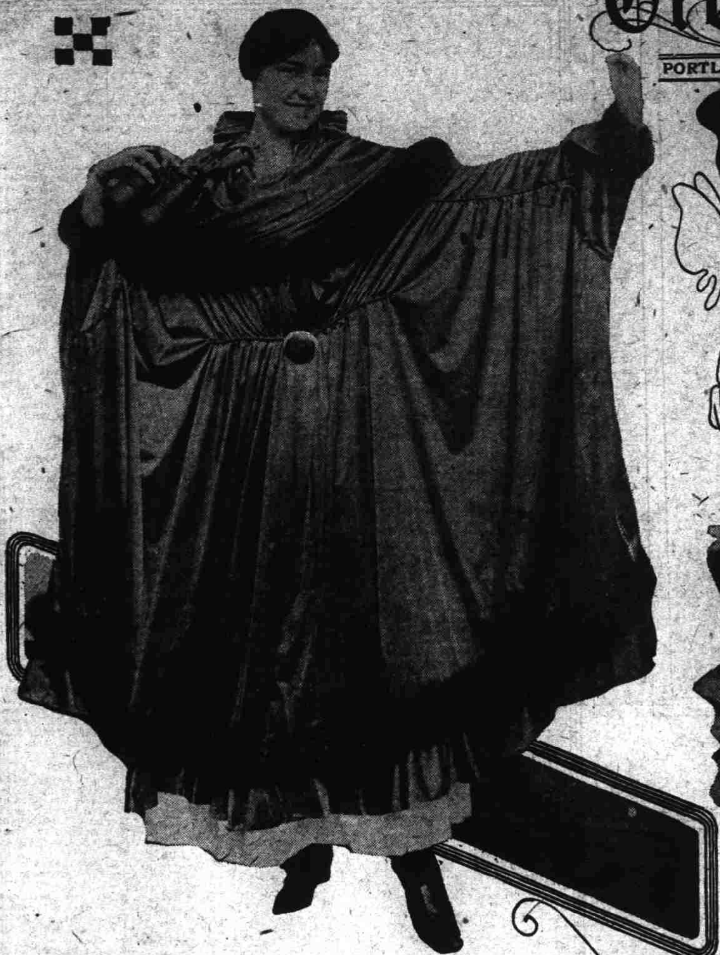
Old gold silk jersey wrap, flowing hood scarf and sleeves. Trimmed with brown maribou.—Meier & Frank.