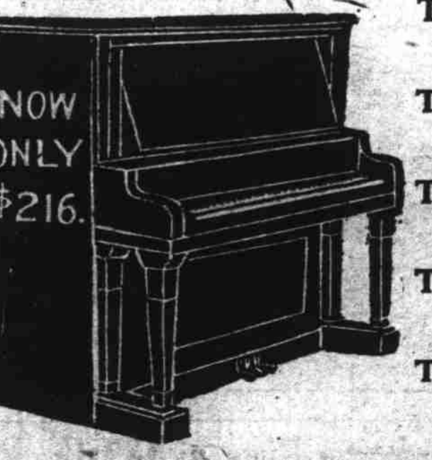
Now only $216. Still other makes, same case design, same size mahogany or walnut, Orlines and verified worth $400; now only $216.