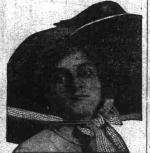
"Do I Look Like I Ever Had a Pimple?"

The skin is a sort of dumping ground for matter and impurities thrown out by the blood. Clean the blood and stop the impurities from forming and you at once clear the skin and make it as it should be.