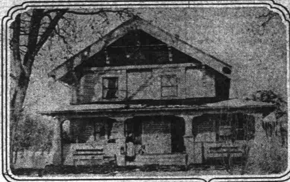
Corey Country home at Mountain Dale, Or.

"Country Life in America," and similar publications devote columns of space to the ideal country home but for coziness, genuine comfort and location few equal the Corey home at Mountain Dale, in Washington county. Situated on the old Corey homestead place of 600 beautiful acres it is the acme of substantiality and comfort, with some of the best fishing and hunting in Oregon only a stone's throw from the door.