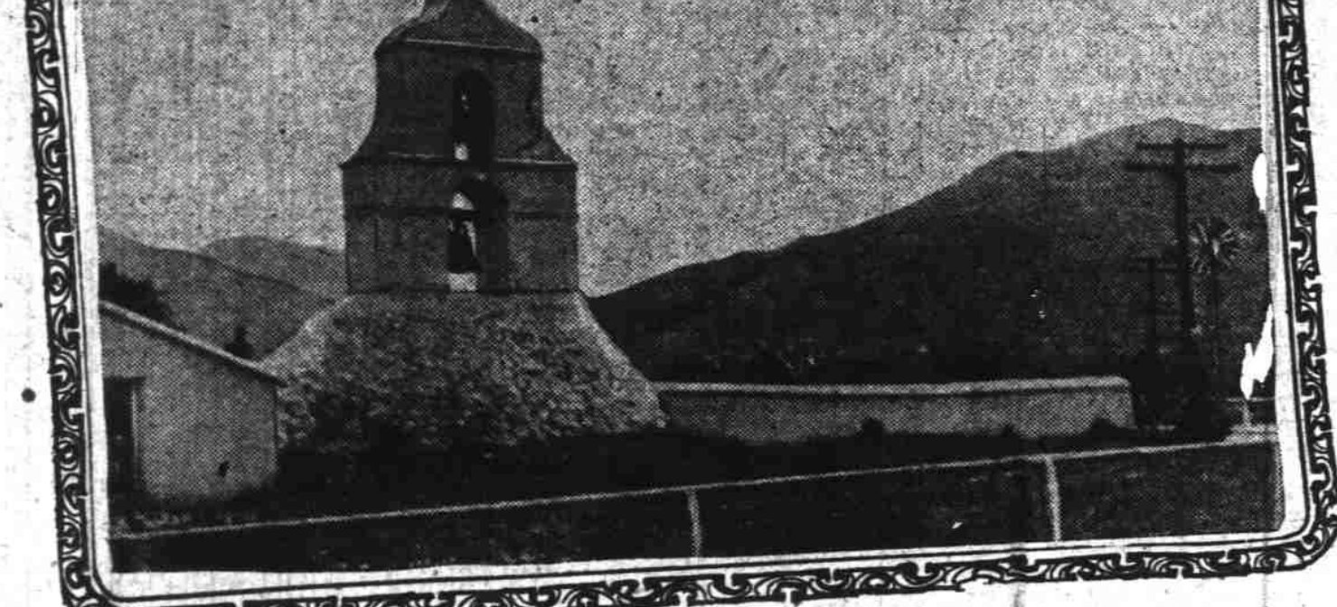
Top—Upper end of San Diego river, California, showing barren nature of watershed, from which torrential rains run as if from a tin roof; Concrete bridge across San Luis Rey river, Oceanside, recently completed at cost of $200,000, destroyed by flood. Bottom—Bells of San Luis Rey mission, San Diego county. This mission is reported destroyed by flood.

"I know that the people are willing to pay for the defense of the nation," the president said. Neither Poor Nor Niggardly. "We are neither poor nor niggardly. But we don't intend to pay more than it is worth. For that reason I have urged congress to build an armor plate plant to make the armor for our own battleships. That will help keep our prices down." In emphatic tones the president asserted that he is absolutely confident that the preparedness program will be carried through. He declared there will be a debate in congress first, but that the plans will not be defeated. The president was given a rousing ovation when he finished his speech.