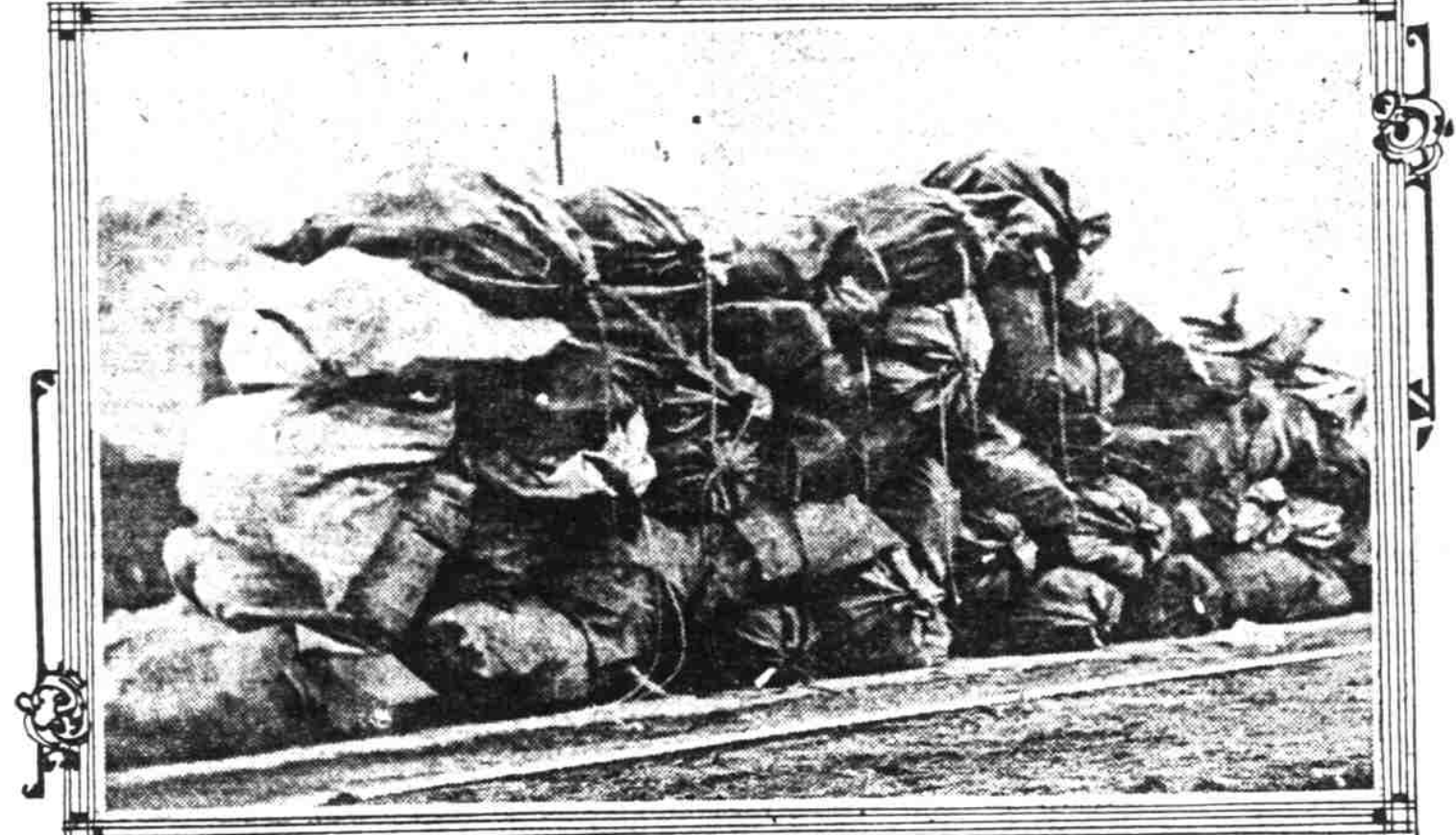
162,200 Pieces of "Wet Mail" for Delivery in Oregon.

Picture from Mayer's, Hornbrook, Calif., showing to prospective patrons preparations made by this great Mail Order House to meet their needs.