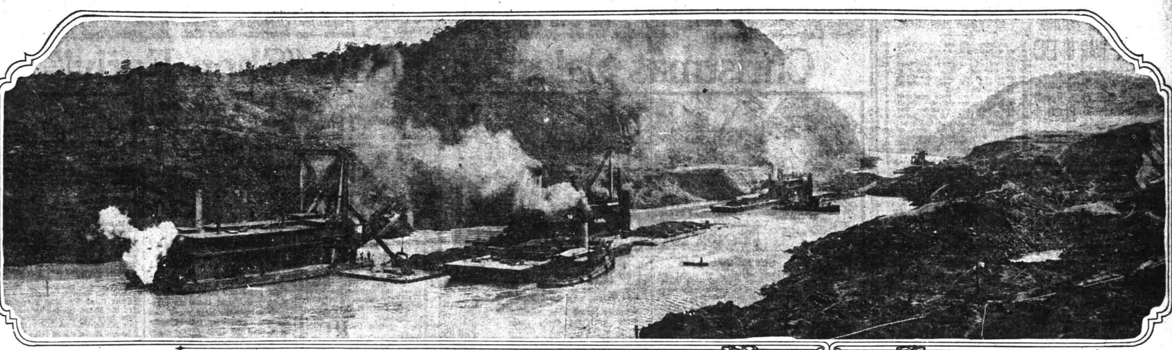
No photograph taken since the heavy slides in the Panama canal Cascadas, a 15-yard dipper dredger, shown in the foreground... The record for a day's work so far on the cut was 44,495 cubic yards dug on Sunday, November 4. The government expects to have the canal ready for service again by spring.