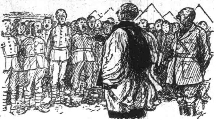
Preacher (at the Volunteer Training Corps Church Parade)—Let us hope that Britain may never be invaded. God for bid that we should ever have to rely on you to defend these shores!