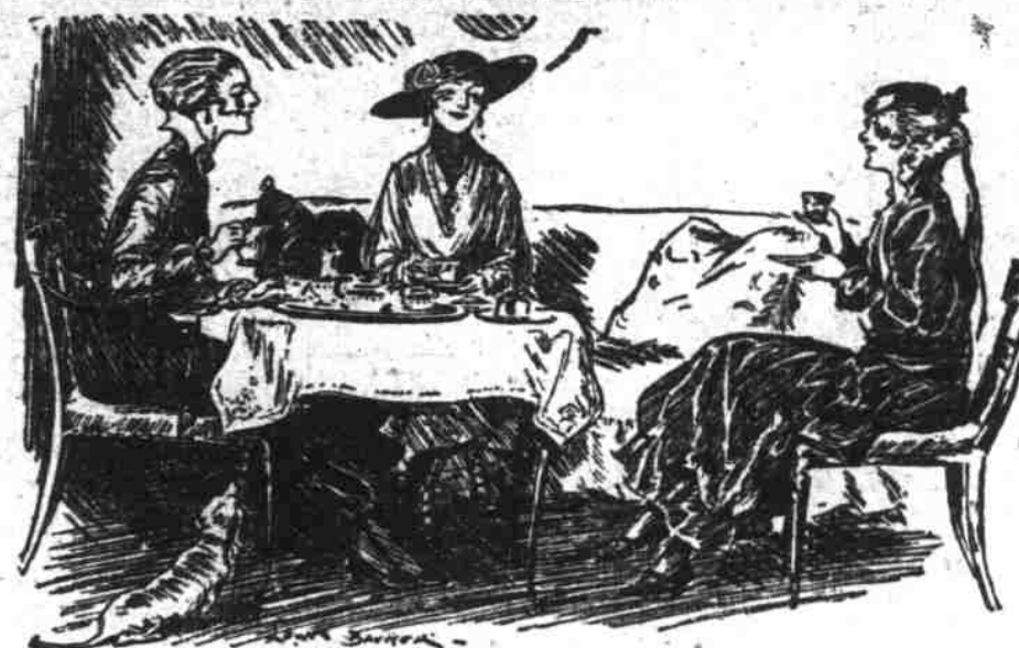
"My husband belongs to the Authors' Brigade. They're getting on splendidly—in fact, I believe they're going in to a third edition."