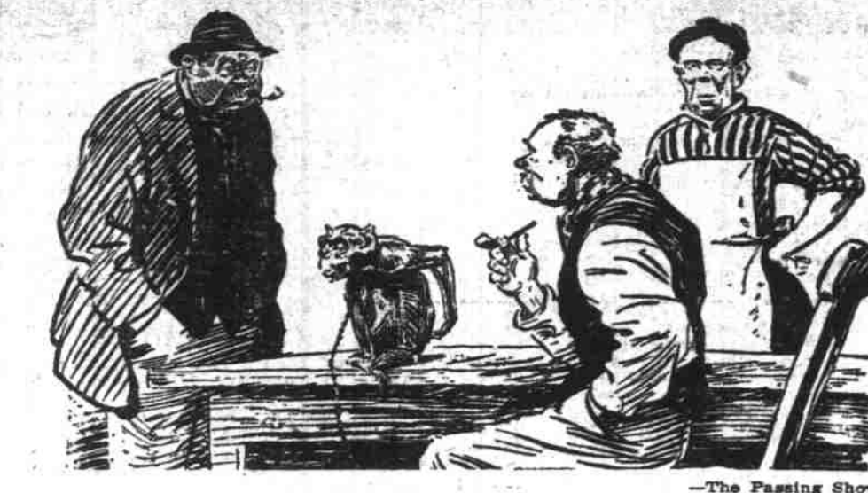
"Where did yer get 'im from?" "Begorra! 'Twas old Marcaroni! 'ad to go to the war, so 'as we've got no kids of our own we said we'd 'ave 'im."