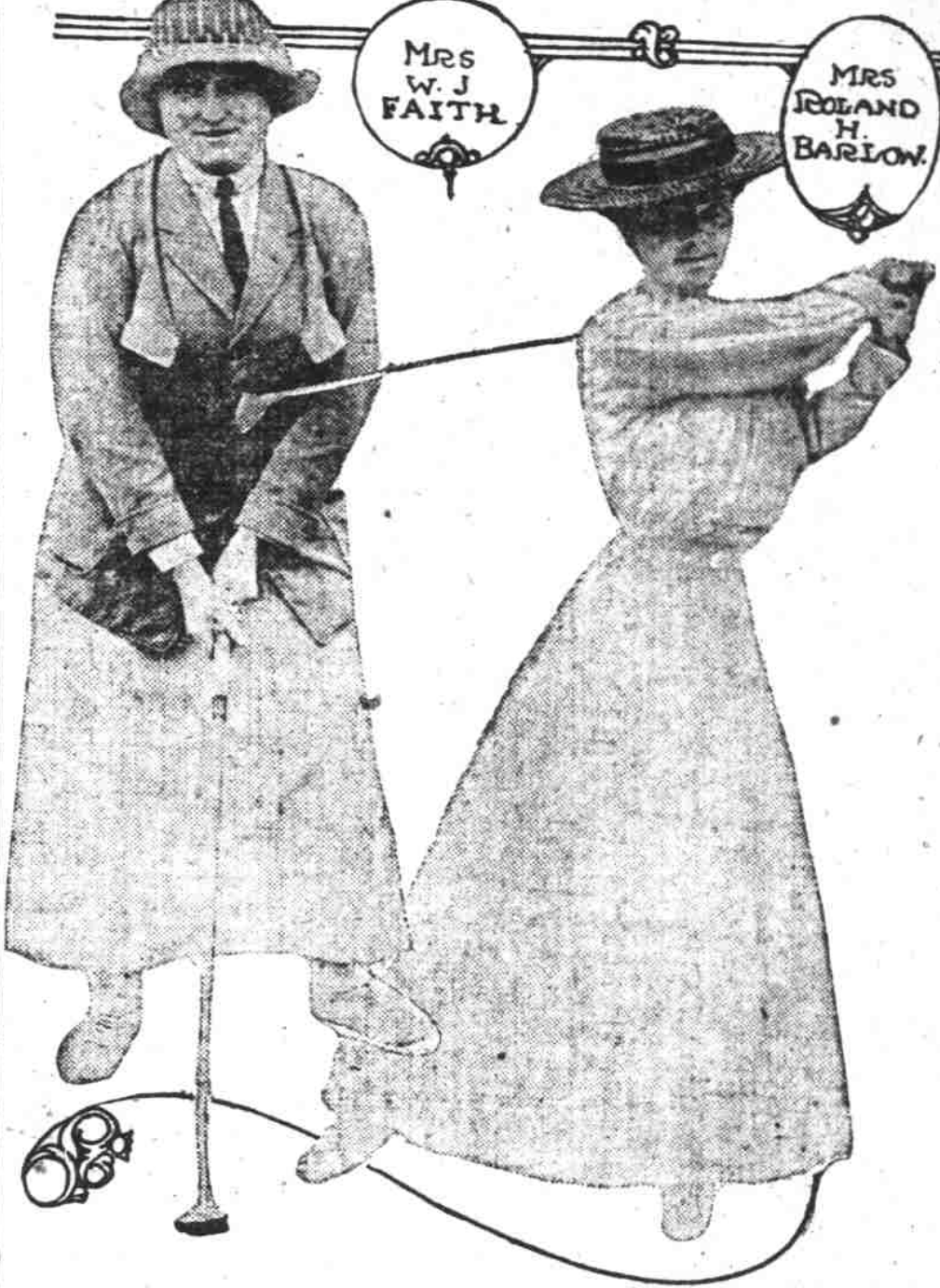
Pair of the best players around the Metropolitan loop of golf ocurses, who are having much success in their game this year.

a diseased brain and promote sleep. "Of course, patients on the golf course will be attended, but just think