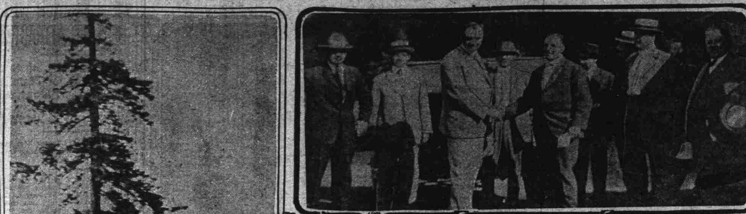
Above—Official party inspecting the drive.