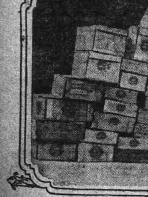
Half carload of paint sent north by Acme White Lead and Color Works.

When Anchorage, Alaska, sprang into existence as the first townsite established on the new government railroad the need for paint there became apparent.