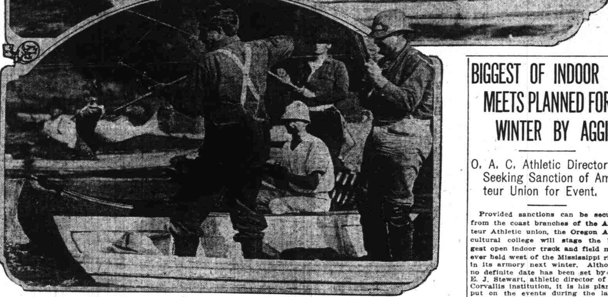
Landing the Royal Chinook salmon, a fighter from away back, in the Willamette river near Jennings Lodge. Yesterday 68 boats filled with enthusiastic fishermen were enjoying the sport and the camera shows they were successful. At the bottom is shown a 30-pounder fighting to the last and trying to wiggle away from the gaff. You can catch them with a six-ounce rod. Oil up your reel and get out on the river.