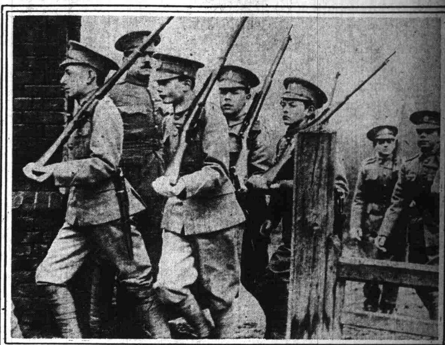
ENGLISH PRINCE LEARNING TO BECOME SOLDIER

Crown Prince of Serbia, at left, talking to Austrian prisoners in Belgrade. Picture taken by Sir Thomas Lipton's Red Cross party.