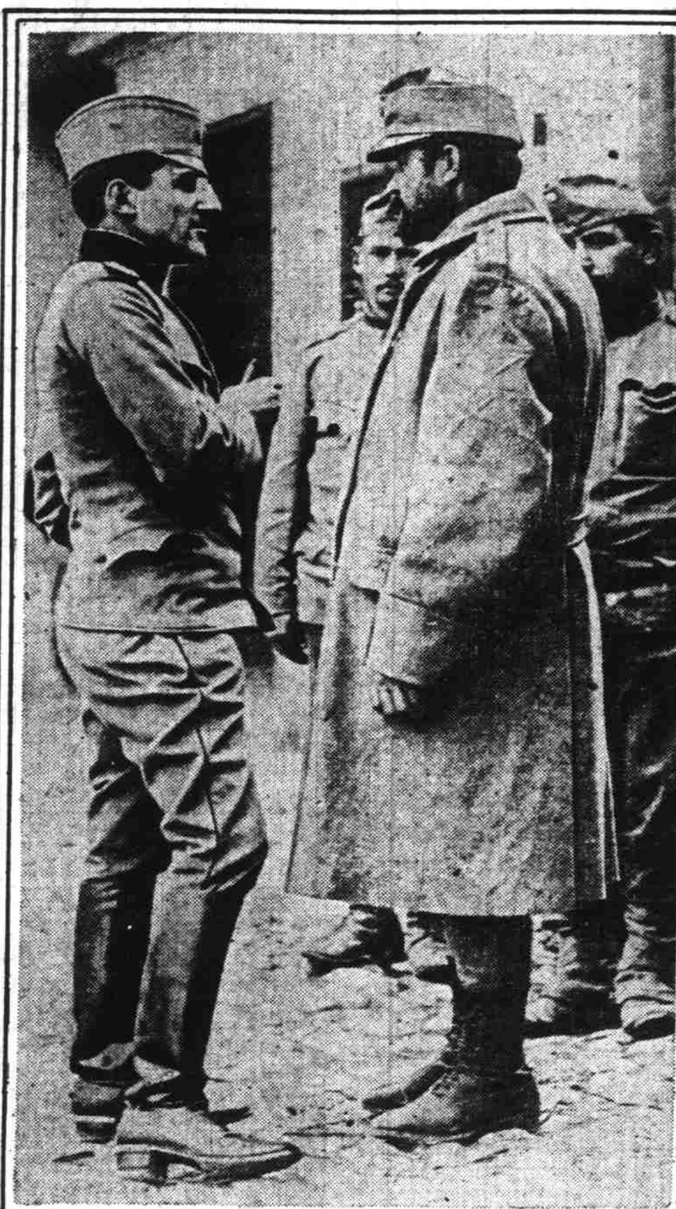
SERBIAN CROWN PRINCE

Scouts of the German army take their field glasses and climb a tree to watch the movements of their foes. This picture was taken at an outpost near the town of Grudusk, Poland.