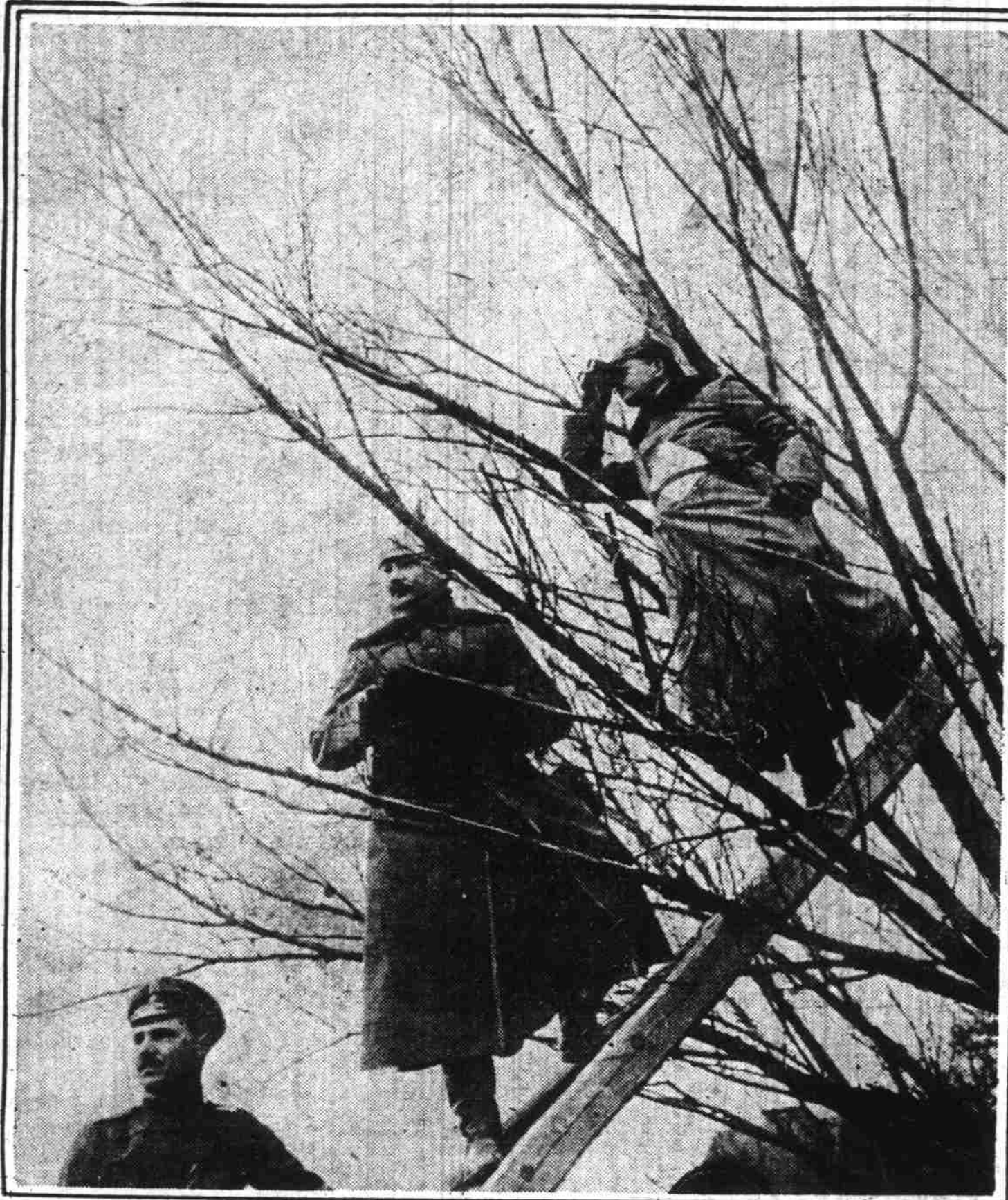
OBSERVING POSITION OF THE ENEMY

Scouts of the German army take their field glasses and climb a tree to watch the movements of their foes. This picture was taken at an outpost near the town of Grudusk, Poland.