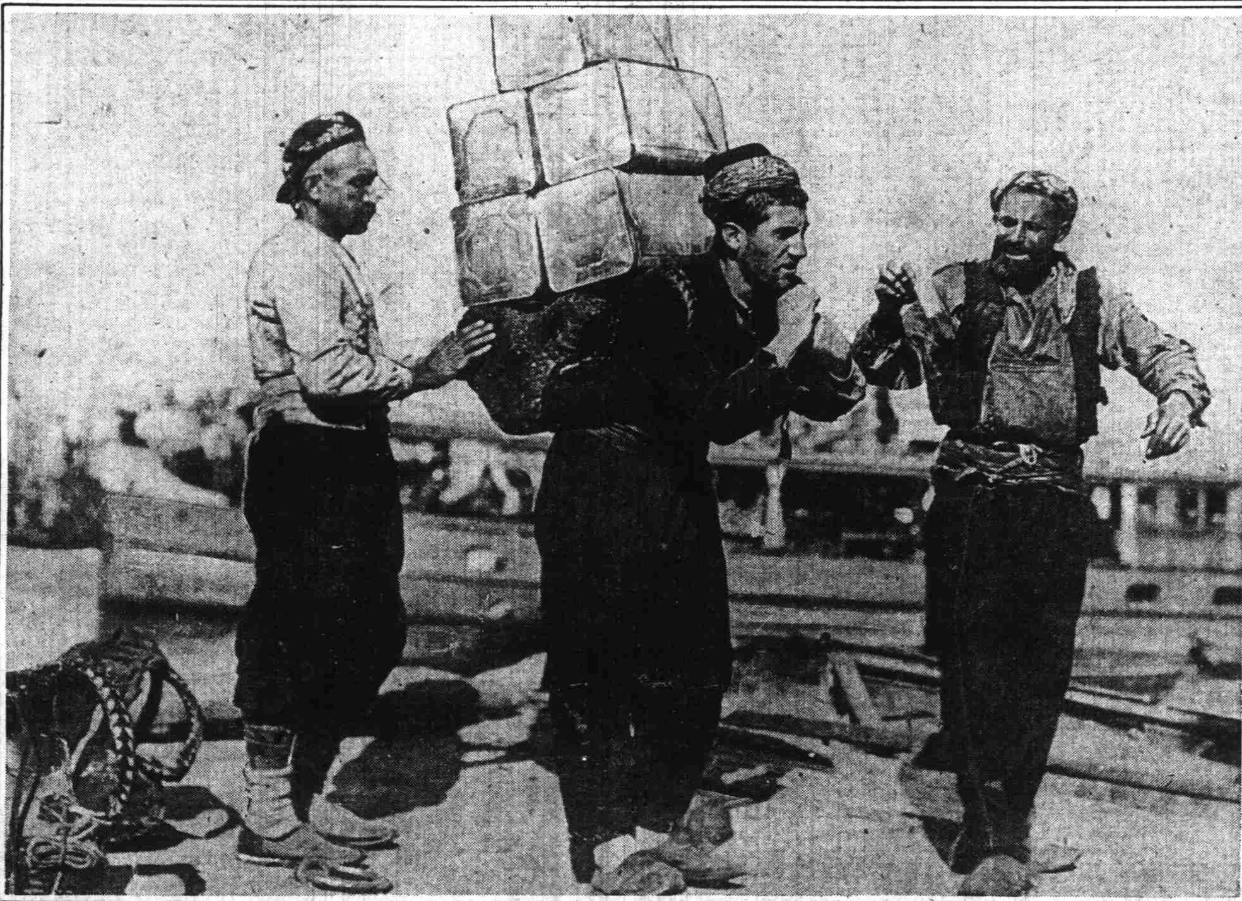
TURKS IN CONSTANTINOPLE CARRYING GASOLINE TO SAFETY

A few seconds before Aviator Stites was dashed to death from his aeroplane (shown above) at Universal City, Calif., March 16, an aeroplane below it was blown up according to program.