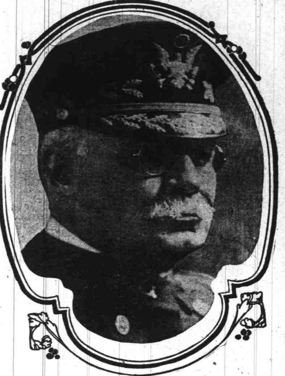
Brigadier General Hugh L. Scott, chief of staff of the United States army.