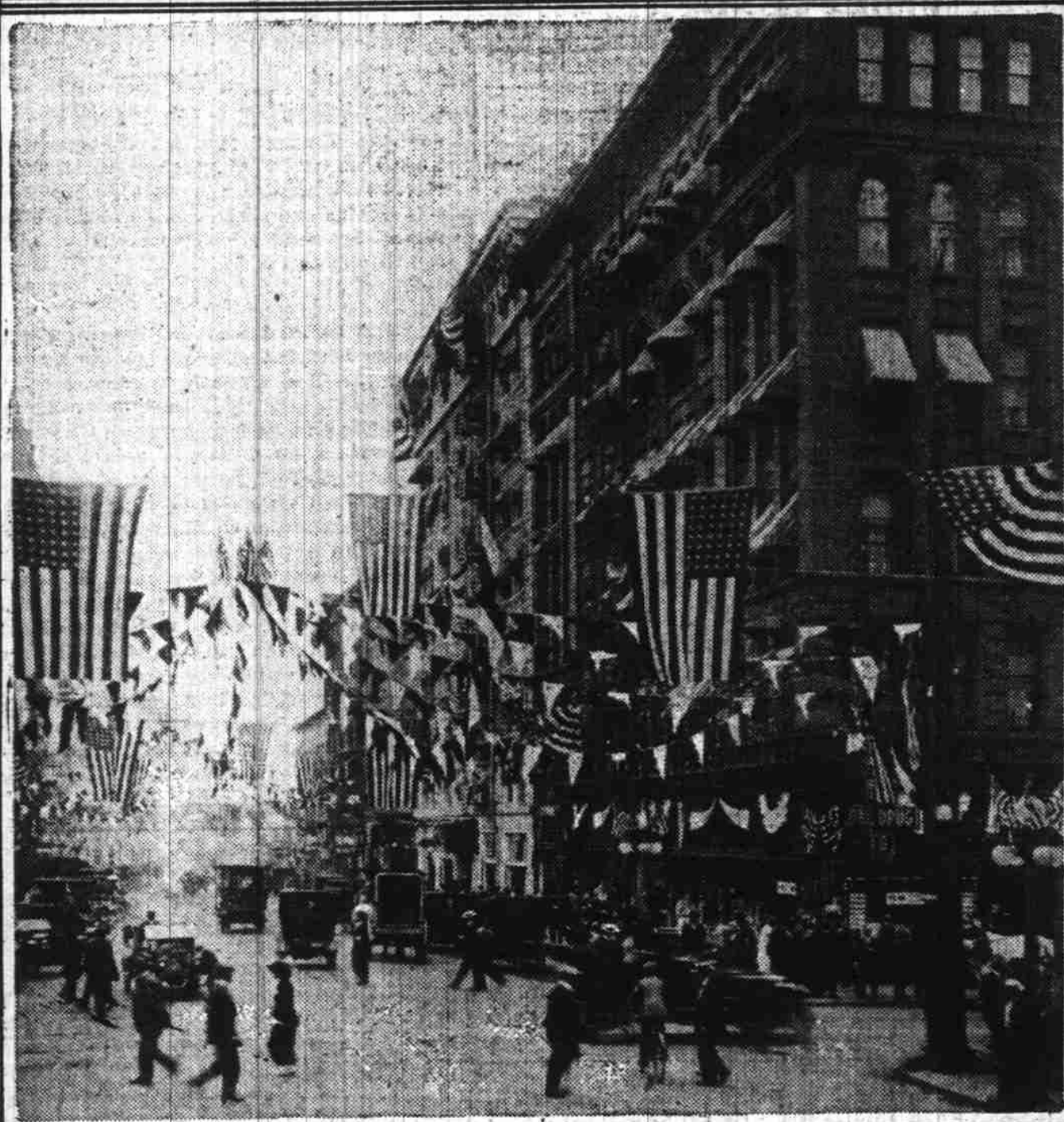
BROADWAY, PORTLAND, IN GALA ATTIRE.