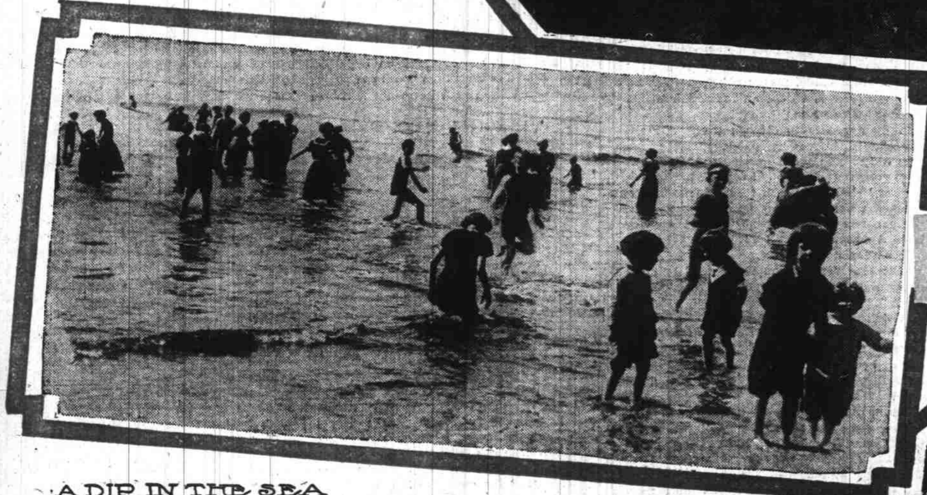
A DIP IN THE SEA