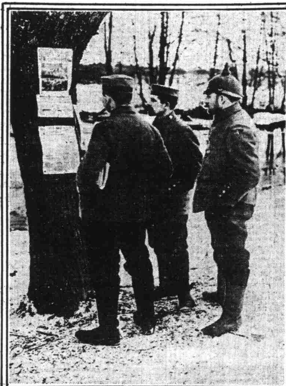
GERMAN SOLDIERS PUBLISH PAPERS For the convenience of the inhabitants of Poland, the German army publishes newspapers in Polish containing news from all parts of the world, sent from Berlin.