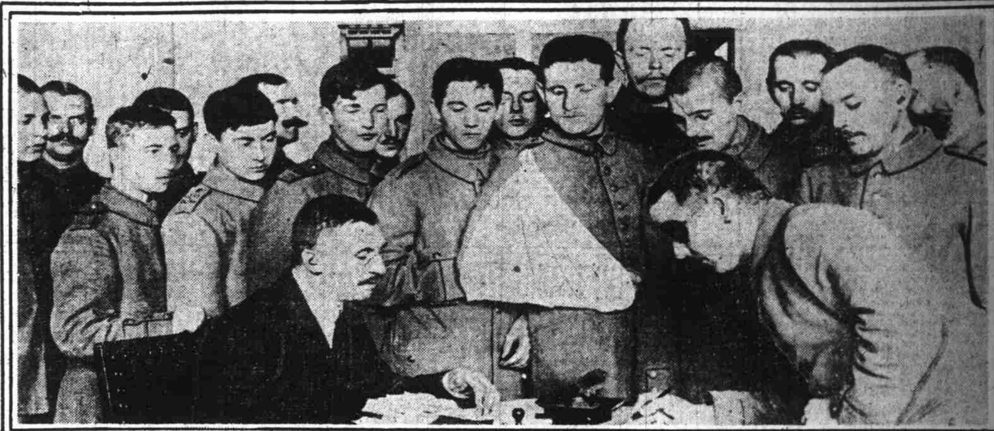
GERMAN WOUNDED IN HOSPITAL GET PAID German soldiers do not lose their pay while they are recuperating in hospitals. This picture was taken when a paymaster visited a Berlin hospital.