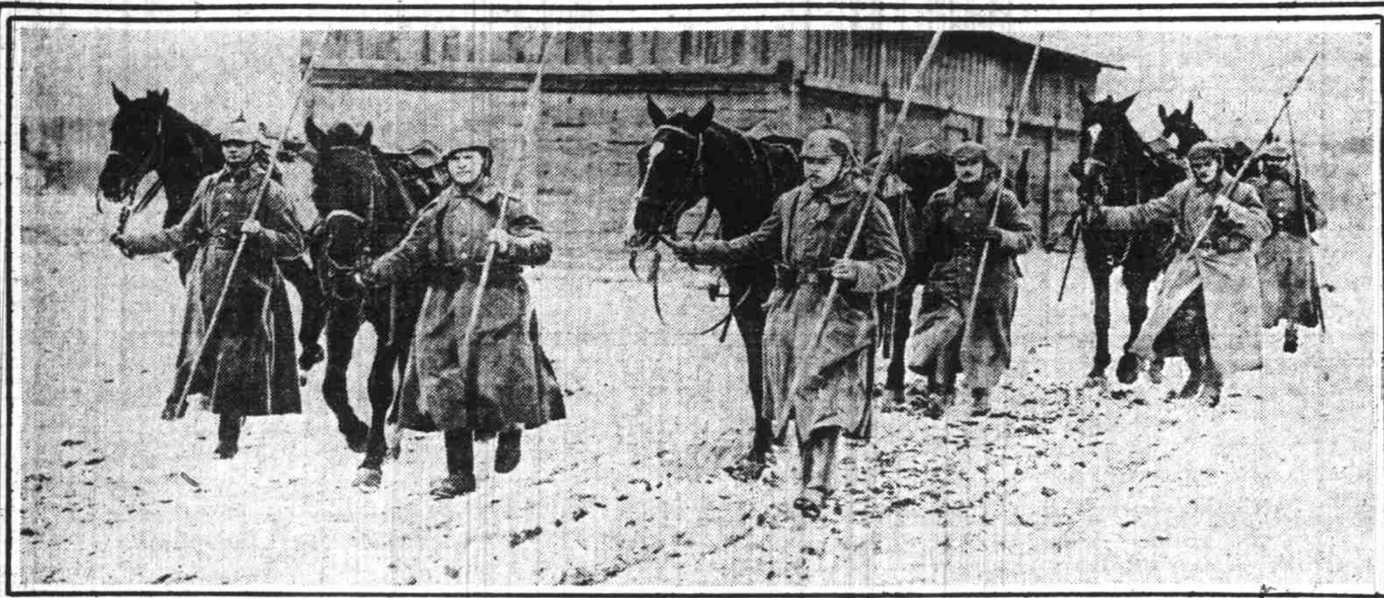
A MERCIFUL MAN IS MERCIFUL TO HIS BEAST Snow and mud make dreary going in Poland. Here is a German cavalry patrol on duty in the Czar's territory walking in order to give their horses a rest.