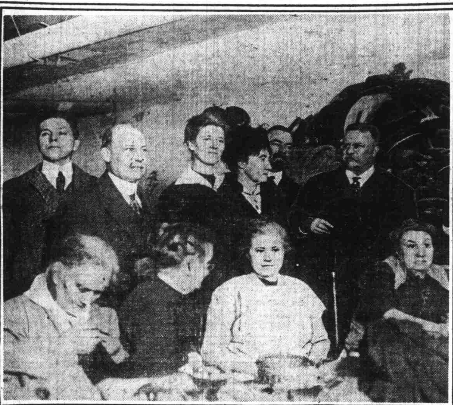
COLONEL ROOSEVELT WORKS FOR CITY Former President Roosevelt recently filed an application for work with the mayor of New York's committee on unemployment and received it. He worked 15 minutes rolling bandages for the allies. With a committee he visited several of the city's workshops investigating conditions.