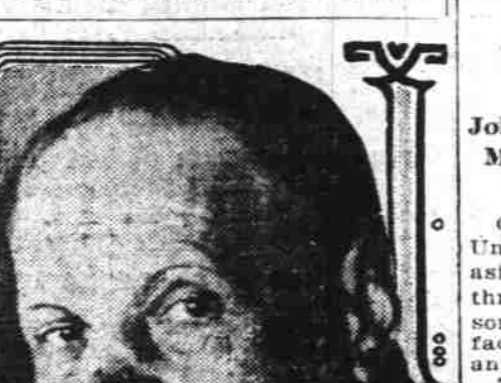
Count Sergius Witte.