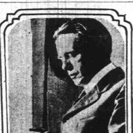
Harry Kendall Thaw.

NEW YORK, March 12.—Harry K. Thaw was cleared today of the charge of conspiring to escape from Matteawan insane asylum.