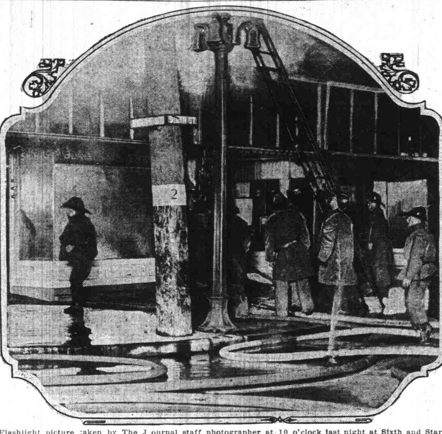
Flashlight picture taken by The Journal staff photographer at 10 o'clock last night at Sixth and Stark