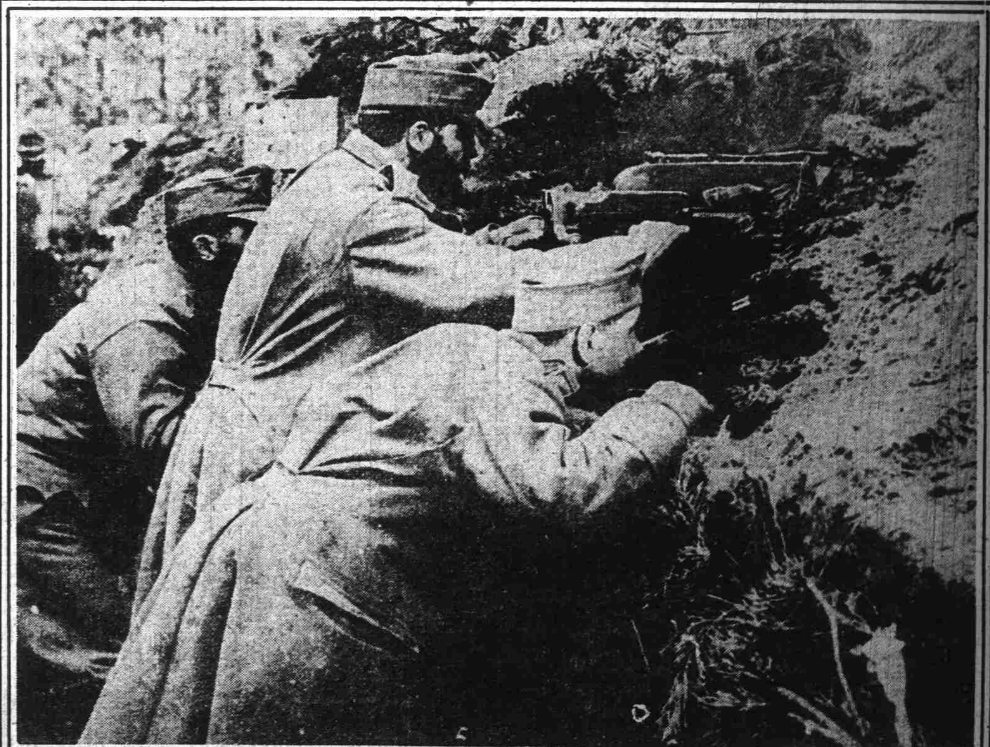
AUSTRIAN MACHINE GUN IN ACTION

England's large fleet of submarines lying in anchor at the harbor of Gosport