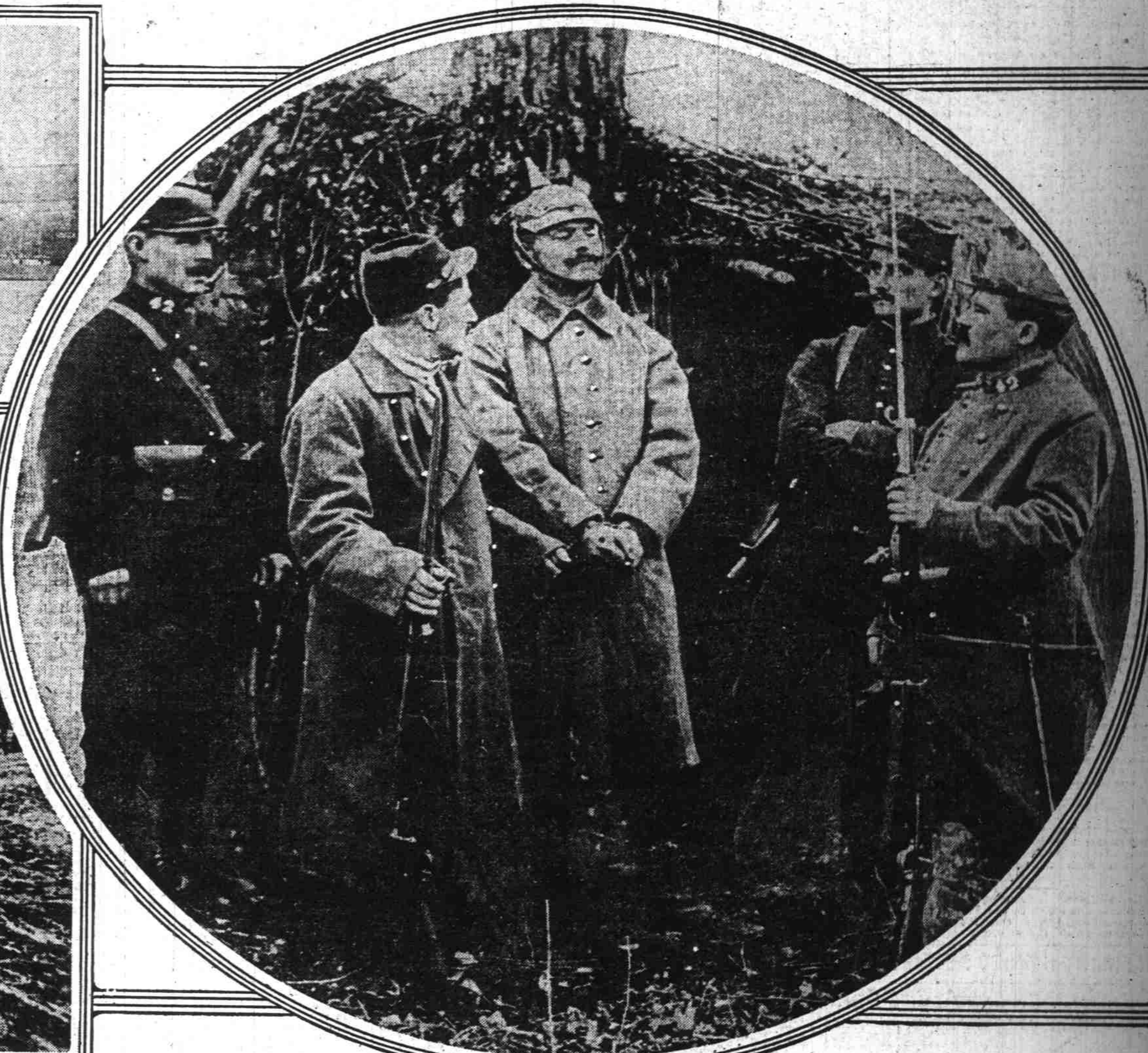
HAD TO HANDCUFF GERMAN OFFICER

Typical scene after a battle where the Germans met the Russian army from the Caucasus mountains. Photograph taken near Petrikau