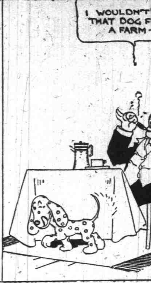
THE OREGON DAILY JOURNAL