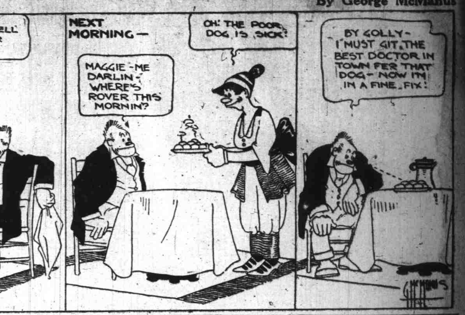
THE OREGON DAILY JOURNAL

Wednesday, March 3 Take Mississippi-Avenue Car to Patton-Avenue