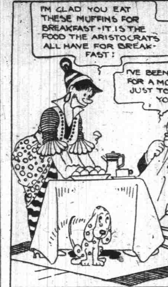
THE OREGON DAILY JOURNAL