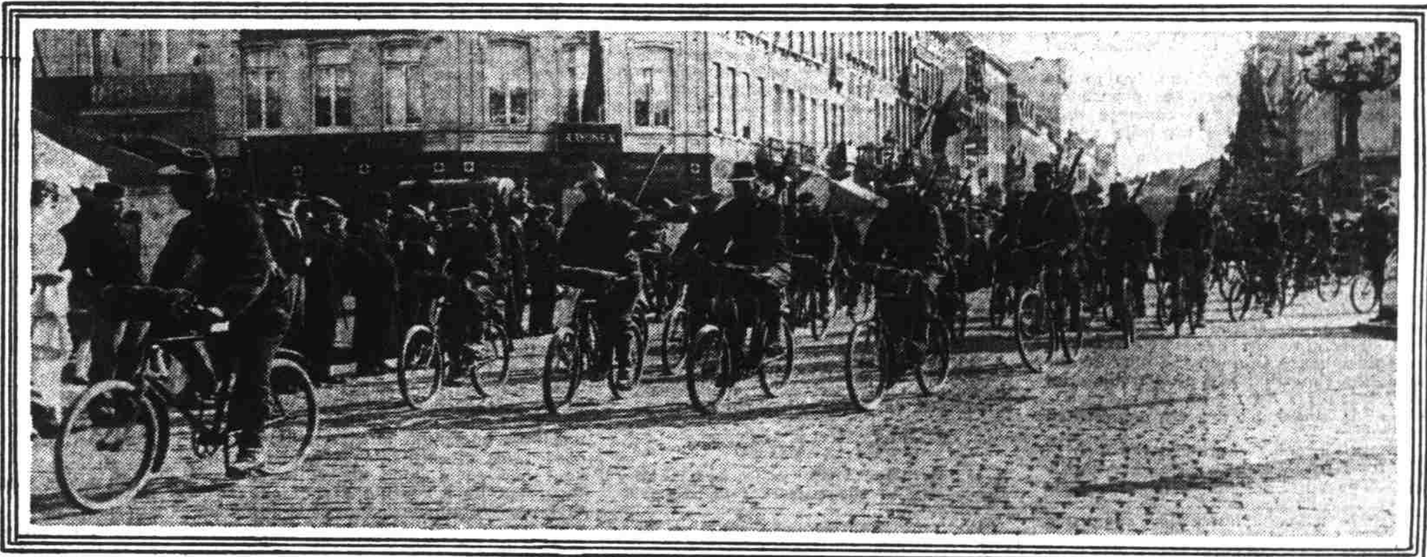
A BELGIAN BICYCLE SQUAD ON THE MARCH This photograph is of chief interest because of the historic interest attached to it. This bicycle corps is shown passing through Antwerp en route to Ostend during the earlier stages of the war, since which time most of the men have been killed.