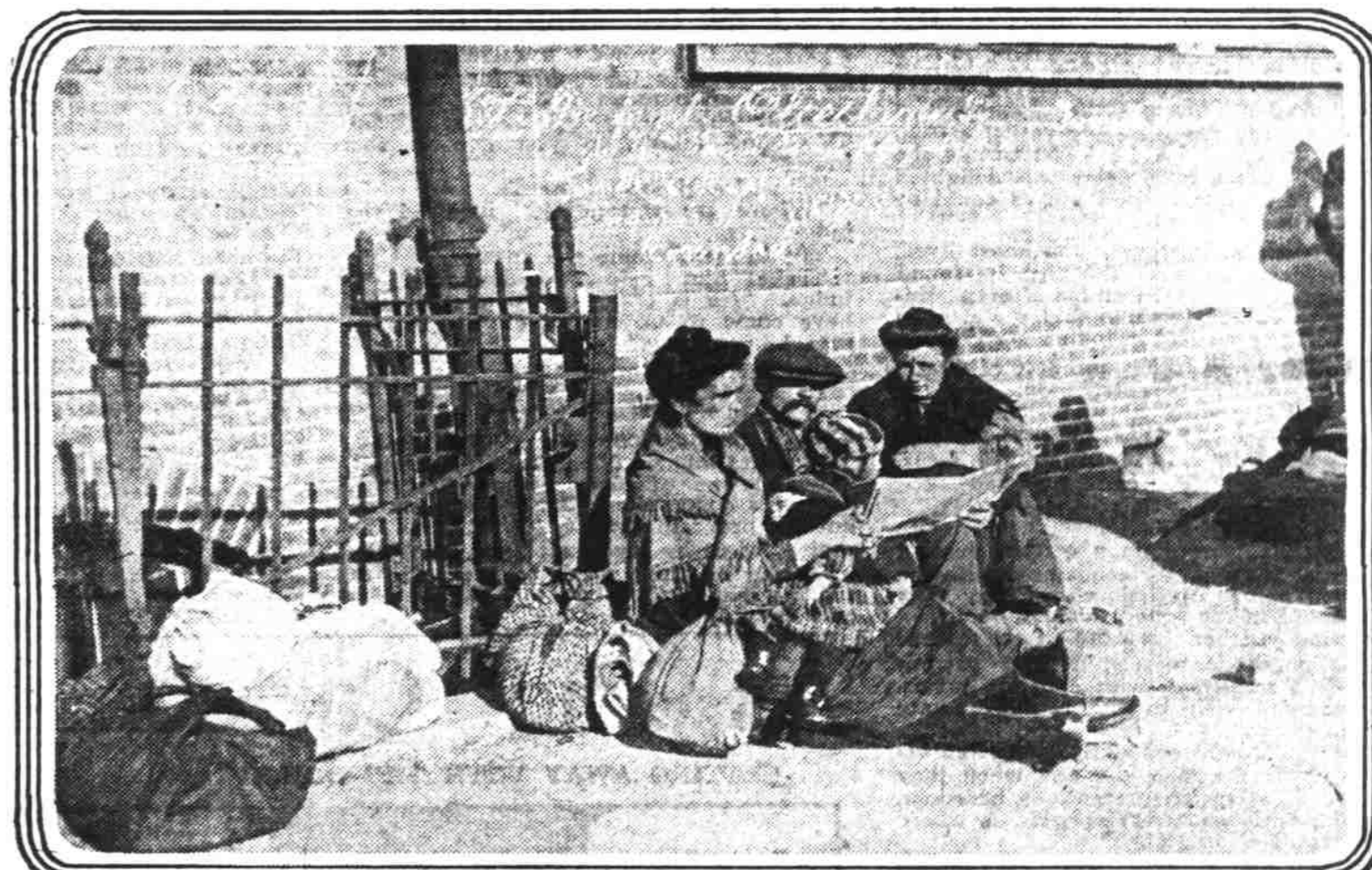
BELGIAN REFUGEES IN HOLLAND In their effort to locate relatives and friends, the refugees chalked their names and messages upon walls, as is seen in the background of this photograph, before which sits a homeless family.