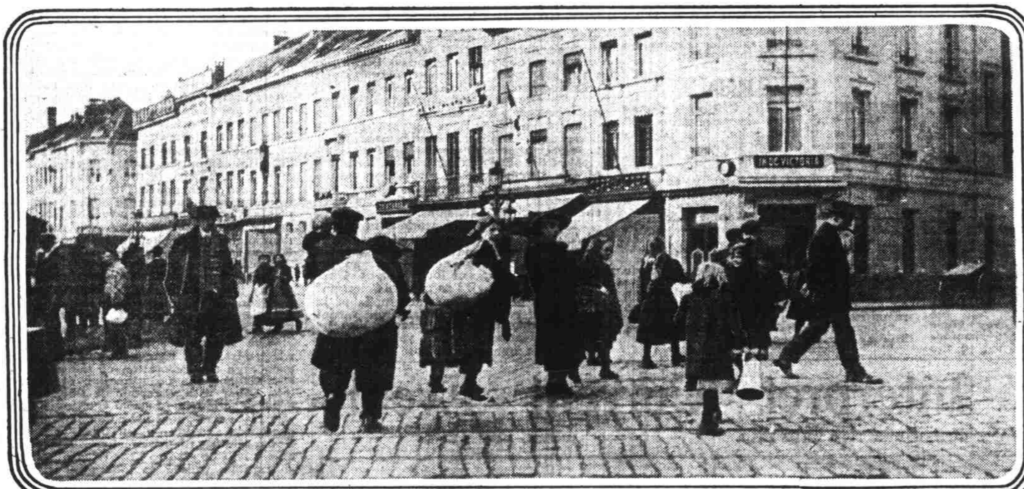
MADE WAYFARERS BY THE WAR This photograph, taken in one of the larger Belgian cities, shows a group of residents, most of them children, preparing for flight. Some of them went to England, but most of them went to Holland.