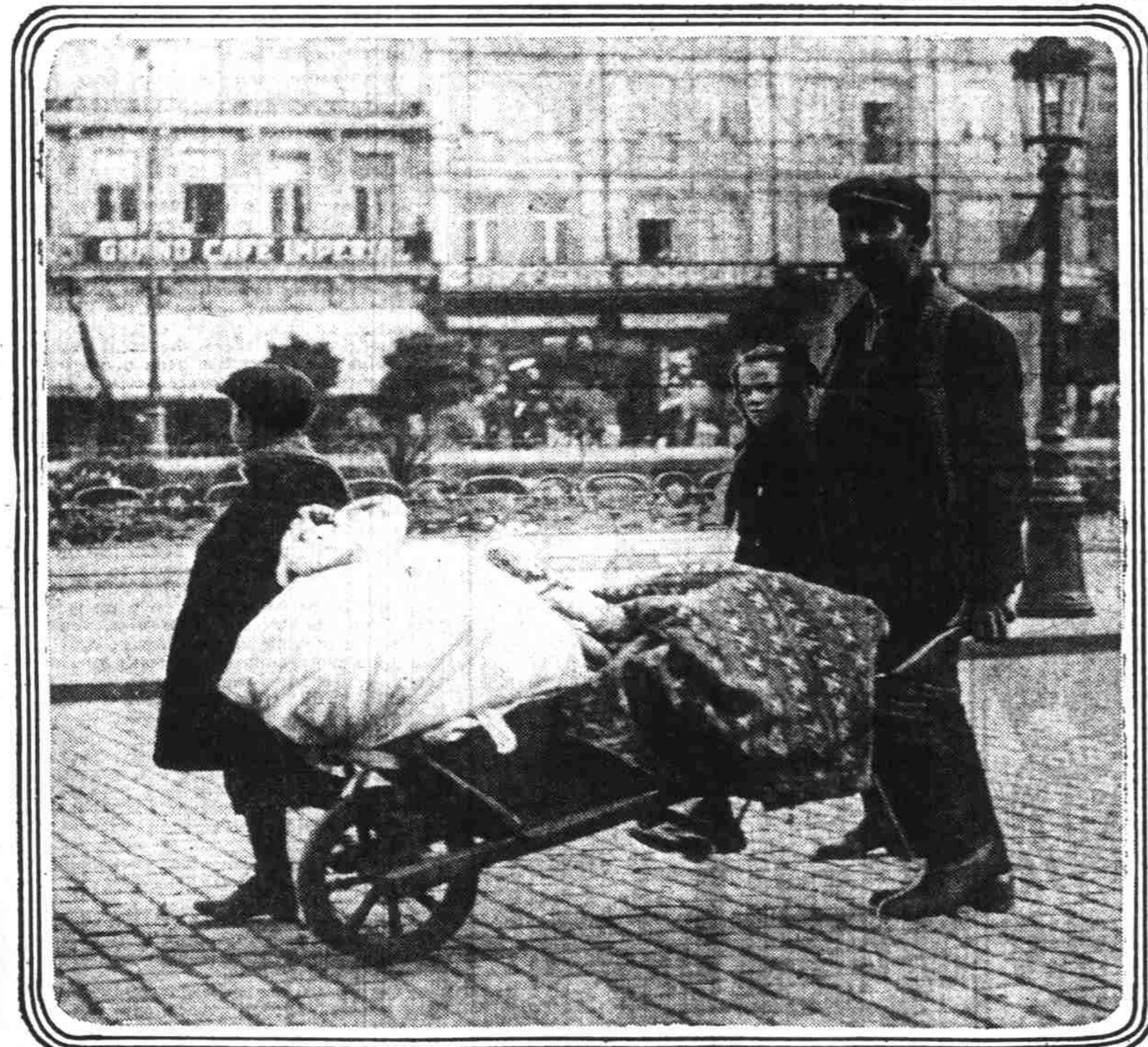
THEY SET FORTH FOR A NEW LAND With all his worldly possessions in a wheelbarrow and accompanied by his children, this Belgian peasant is on his way to the frontier that he may enjoy a haven of safety in Holland until war is ended.