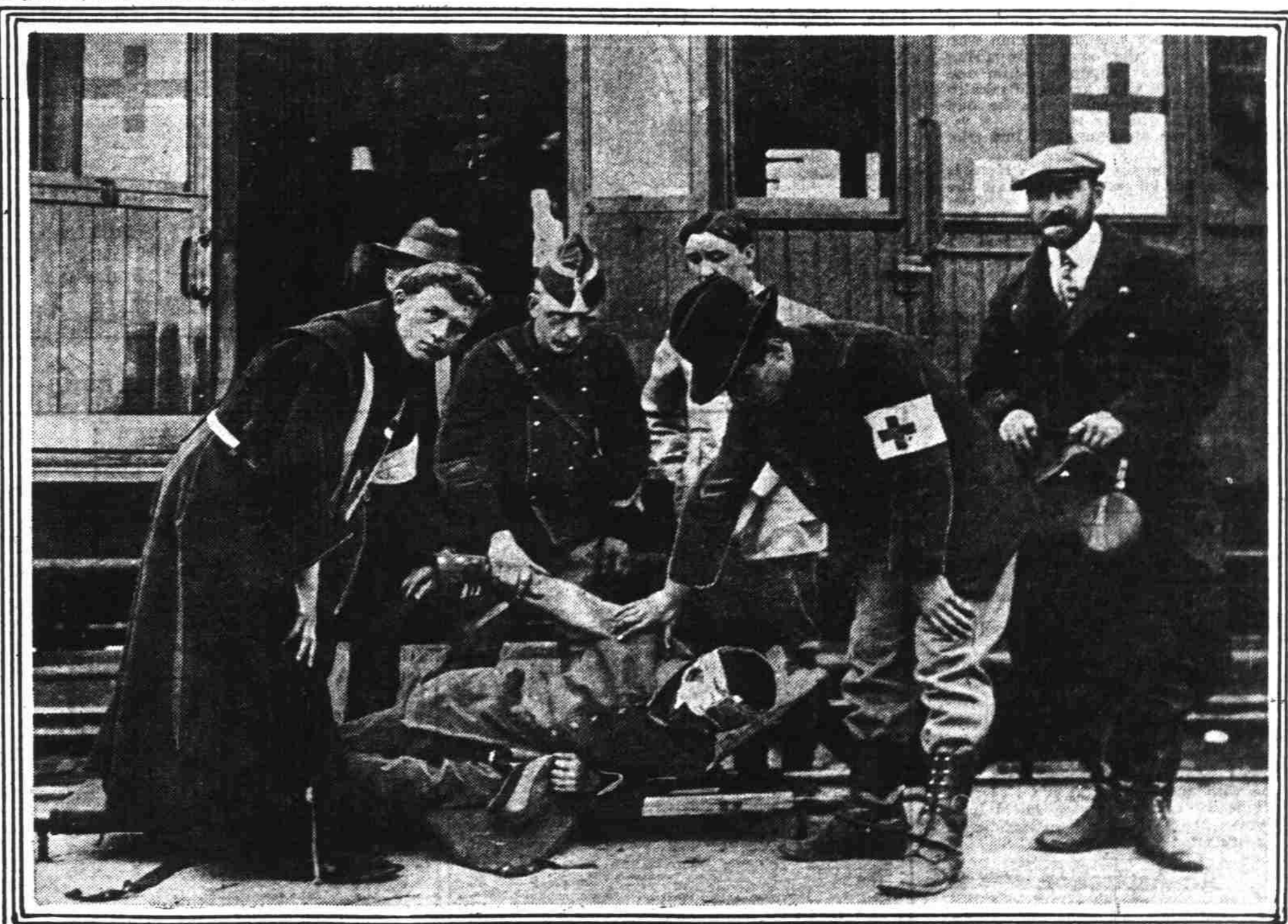
A WOUNDED GERMAN BEING CARED FOR BY THE BELGIANS Belgian Red Cross workers are seen rendering what aid they can to the stricken German soldier who has been removed from a hospital train. This photograph was taken near the French frontier in Belgium during the earlier stages of the war.