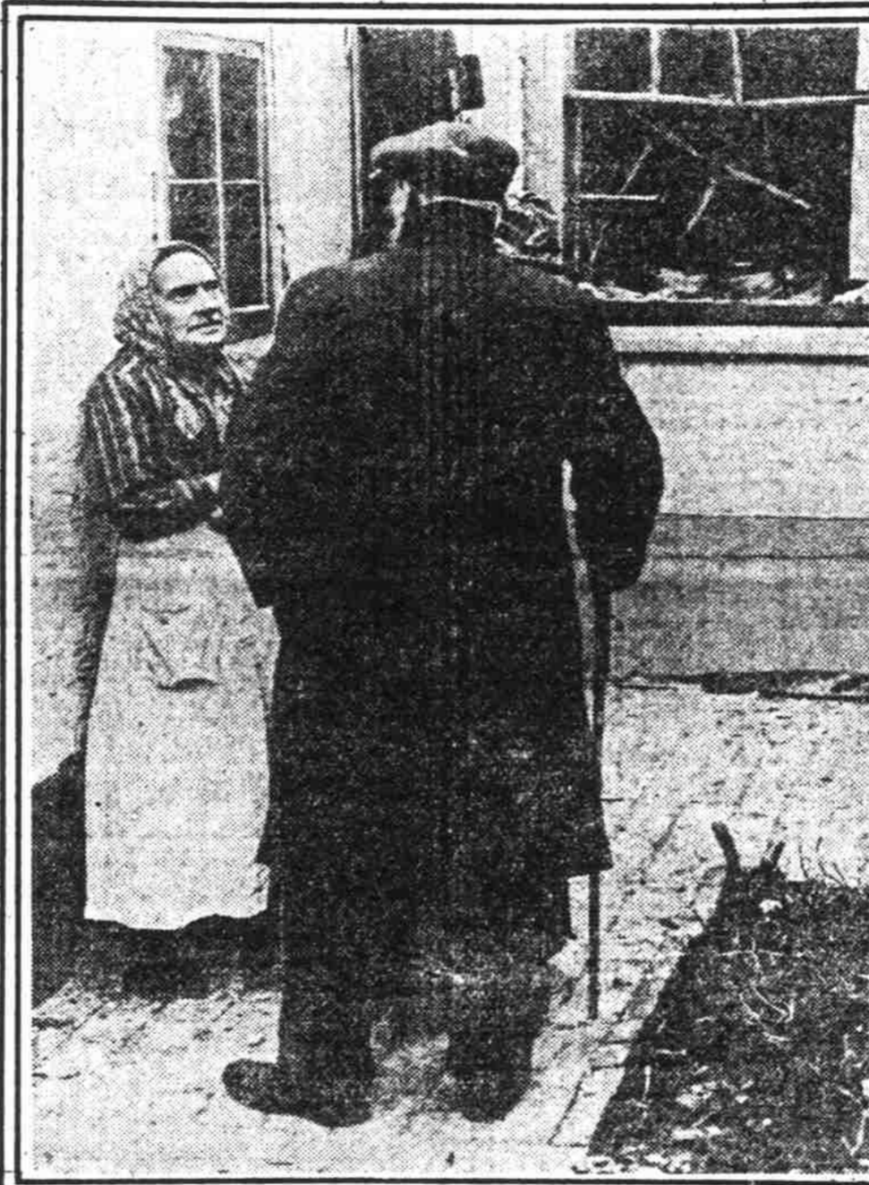
NARROW ESCAPE FROM GERMAN AERIAL BOMB The old lady in the picture had a narrow escape from death during the German aerial raid on the British east coast.