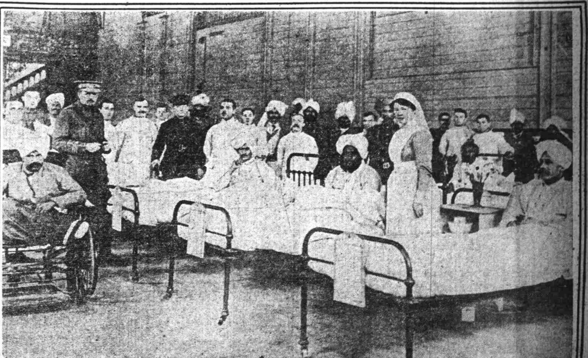
WITH THE INDIAN WOUNDED AT BRIGHTON Wounded Indian soldiers in an English hospital at Brighton, where they have been transported from the battlefields of France and Belgium. The man at the left in the chair has lost both his legs.