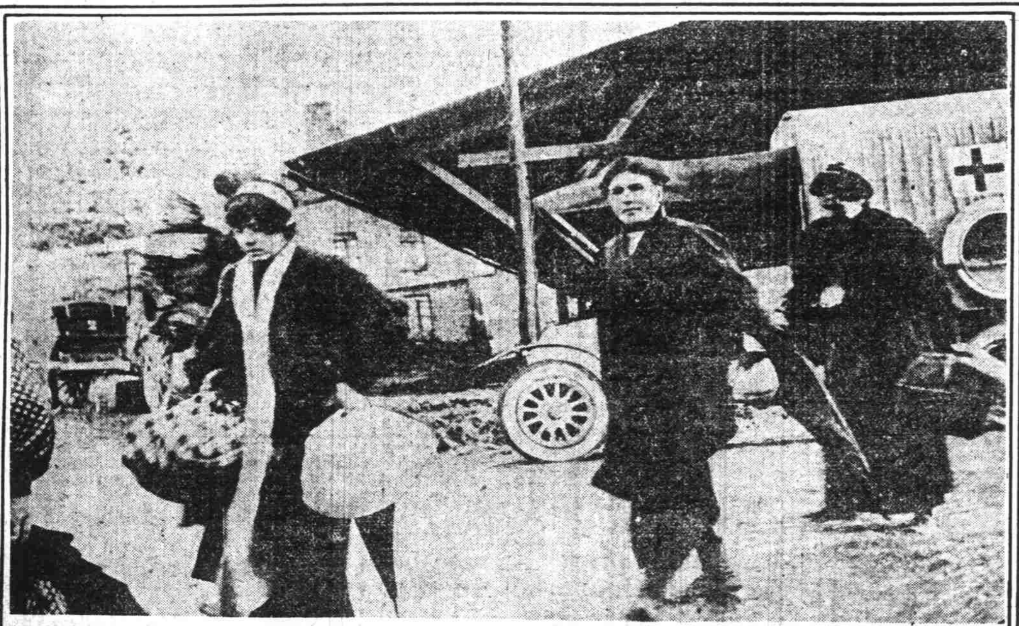
RESIDENTS OF SOISSONS FLEEING FROM BOMBARDMENT After the terrific bombardments at Soissons many of the residents have left their homes for safer quarters. The picture shows French women, with such household possessions as they are able to carry, hurrying away during a cessation in the firing.