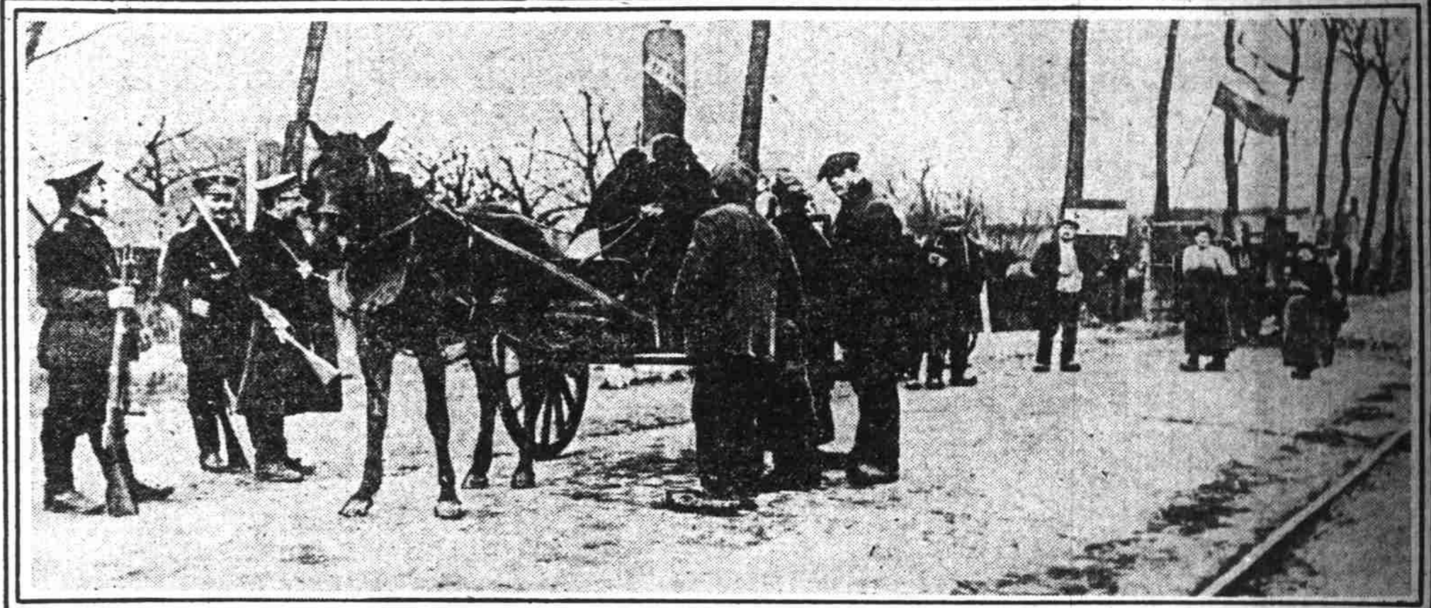
GERMAN GUARDS ON THE DUTCH-BELGIAN FRONTIER This photograph was taken on the frontier between Holland and Belgium. The Dutch trader in provisions is having the contents of his cart examined by German guards on the lookout for contraband.