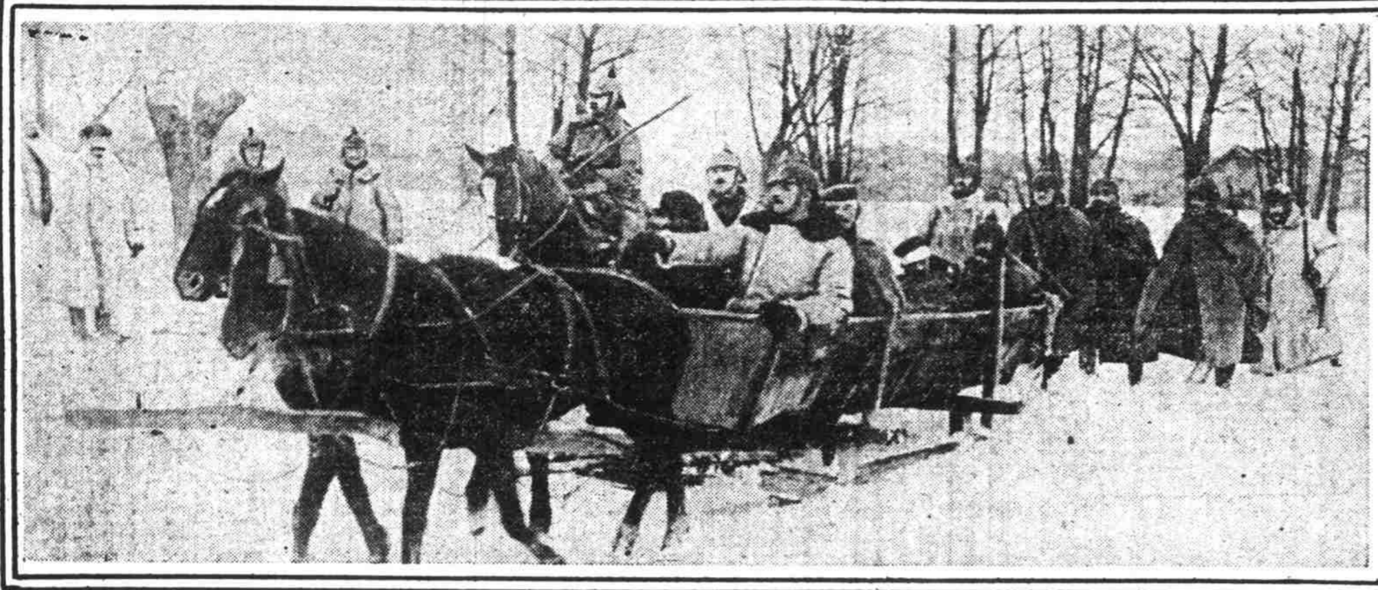
SLEIGHS USED AS AMBULANCES IN POLAND In the heavy snows of Poland, the Germans have been forced to use these rough sleighs as ambulances in order to transport their wounded to the hospital bases near the front.