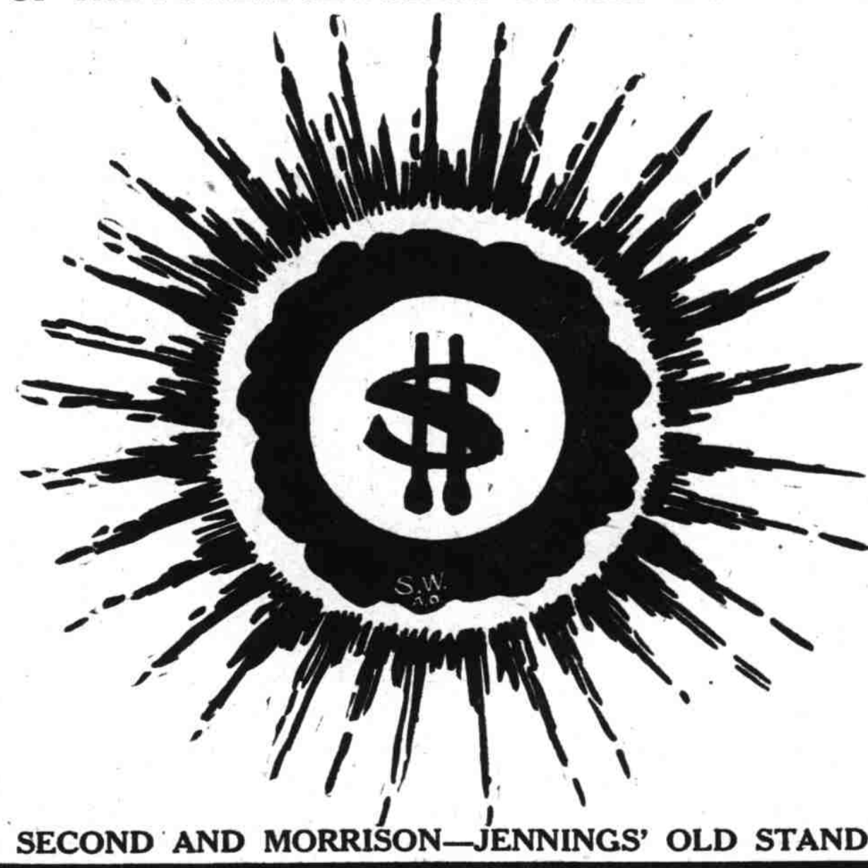
SECOND AND MORRISON—JENNINGS' OLD STAND