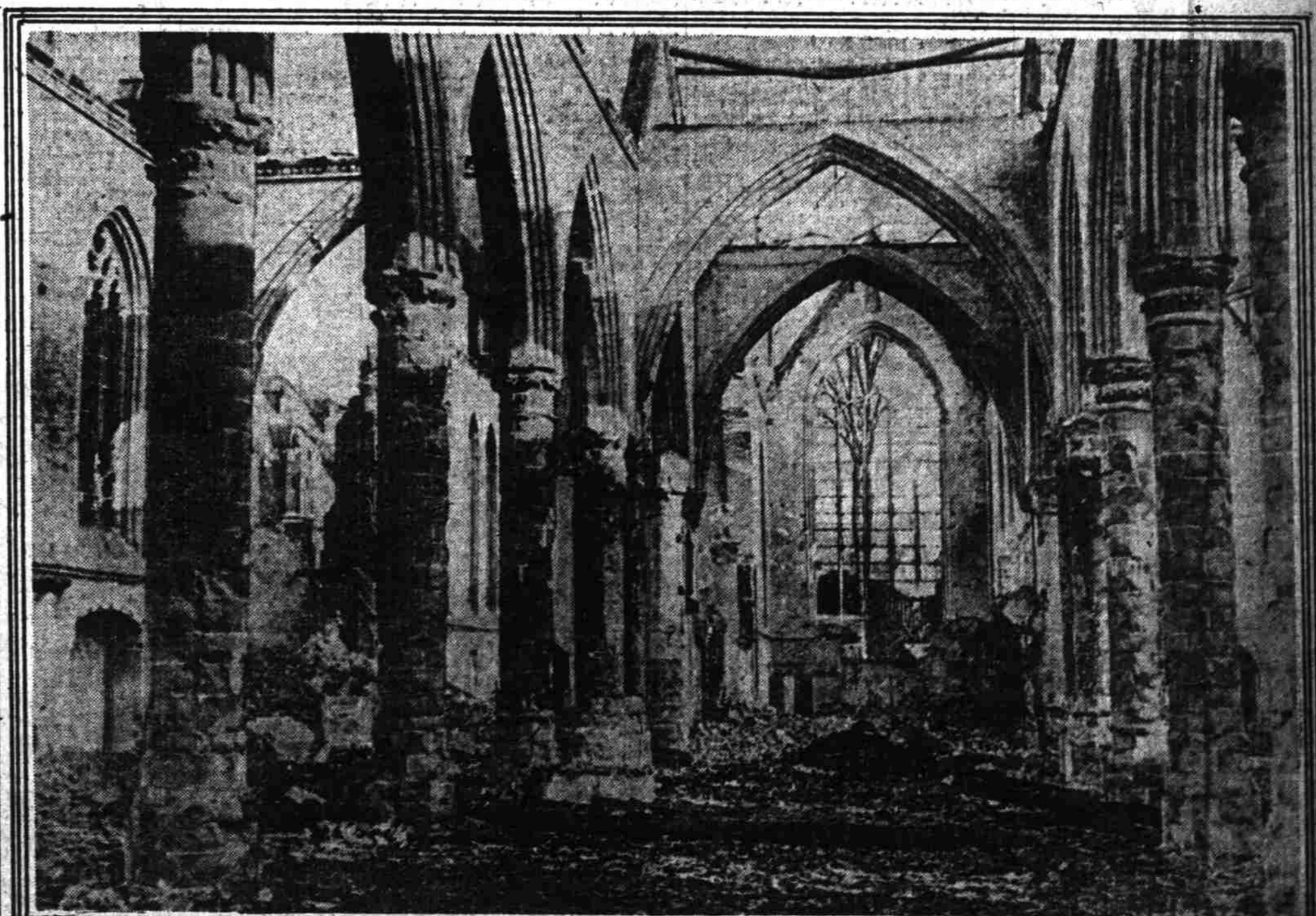
CATHEDRAL WRECKED BY GERMAN SHELLS The Cathedral at Nieuport, Belgium, after the bombardment of the town by the Germans