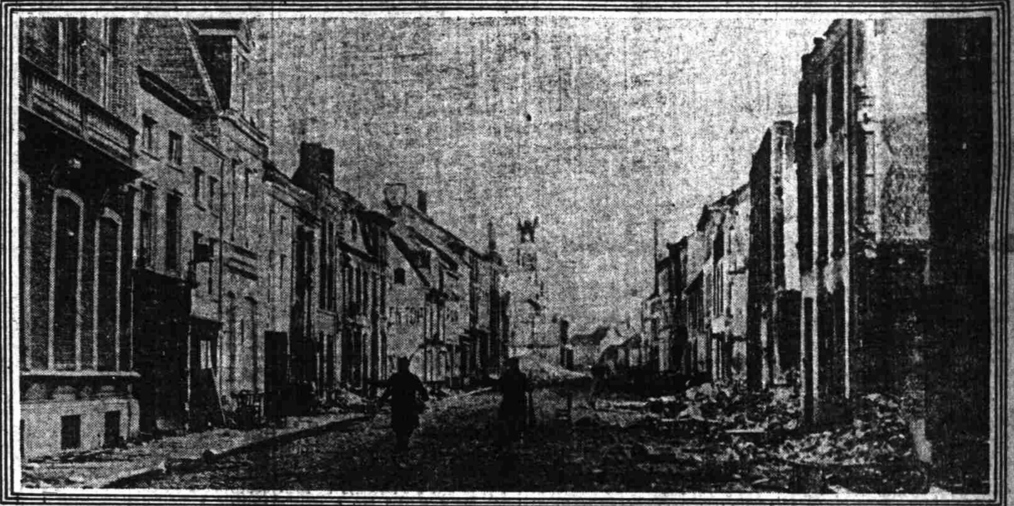
DIXMUDE, BELGIUM, HAS BEEN BATTERED BY BATTERIES FROM BOTH SIDES A street scene in Dixmude, Belgium, where furious fighting took place, showing the ruins caused by shell fire from both sides