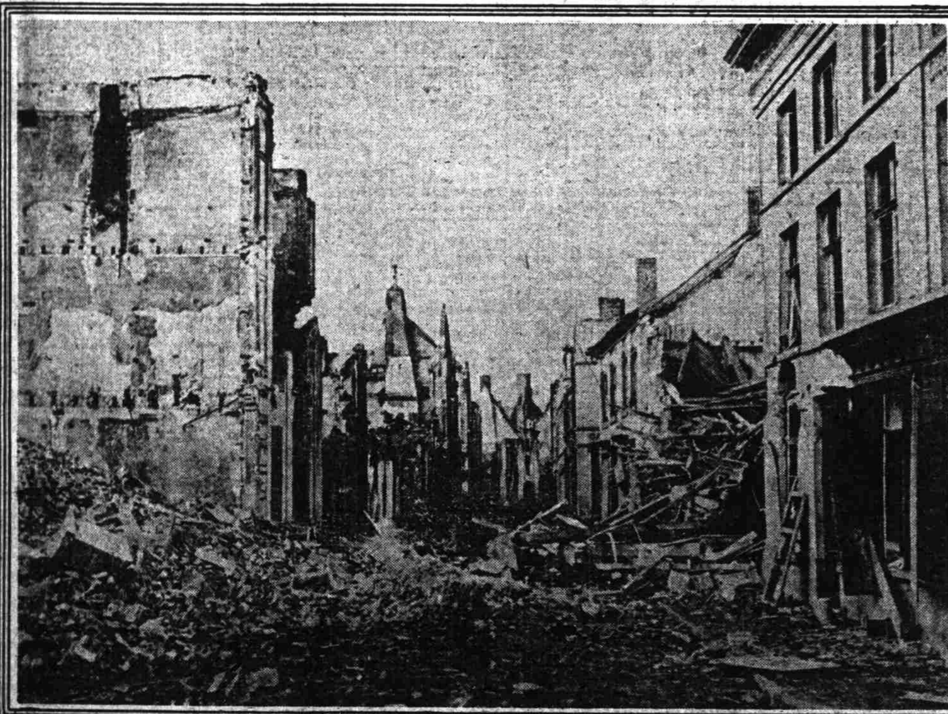
ANOTHER SCENE IN DIXMUDE AFTER THE BATTLE Main street in Dixmude, Belgium, a heap of ruins after the terrific battle