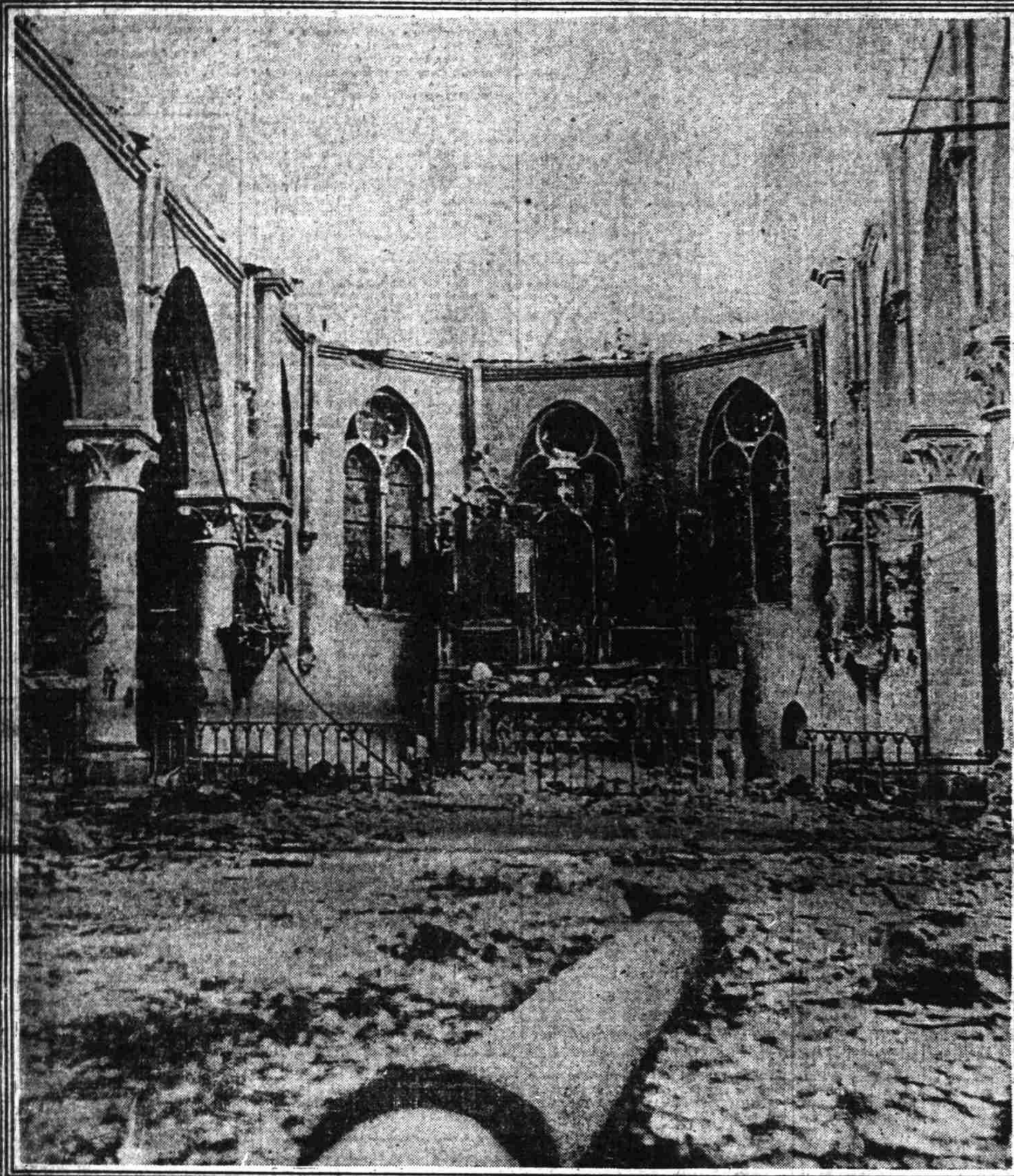
WRECKED CHURCH AFTER A GERMAN BOMBARDMENT The interior of the Church of Vieille, the results of the German bombardment during the battle of October 18