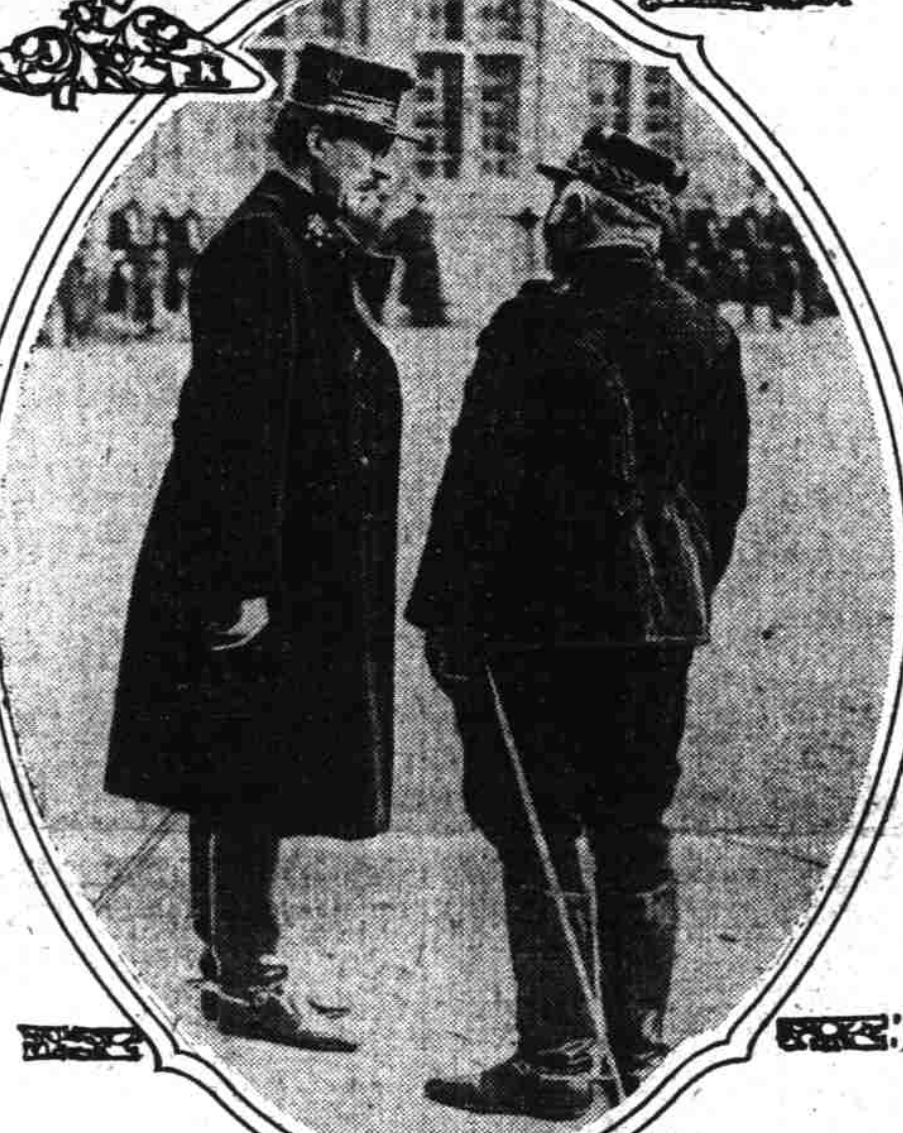
Top—Prince Alexander is a brother of Queen Mary of England. The photo shows him leaving Farnes for an inspection trip along the firing line. Bottom—King Albert of Belgium congratulating the commander of the Seventh regiment of France on his command. The king decorated the officers and regiment with the Order of Leopold. Farnes, Belgium.