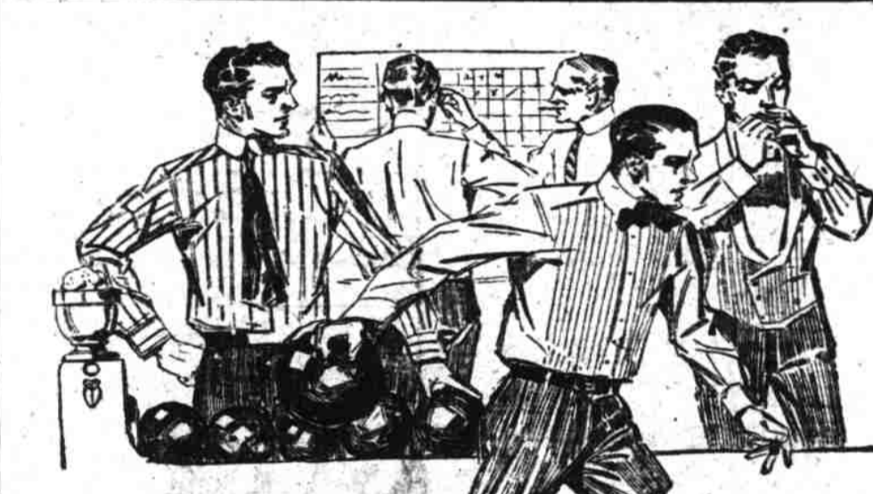
Agents Knox Hats for Men.